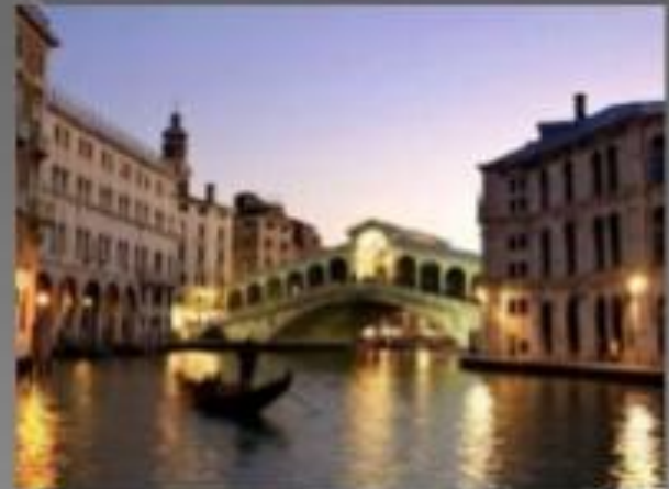
Canal of Venice