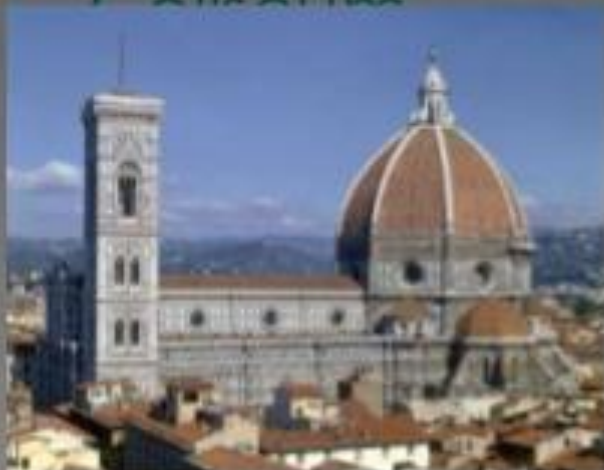
Santa María de Fiore