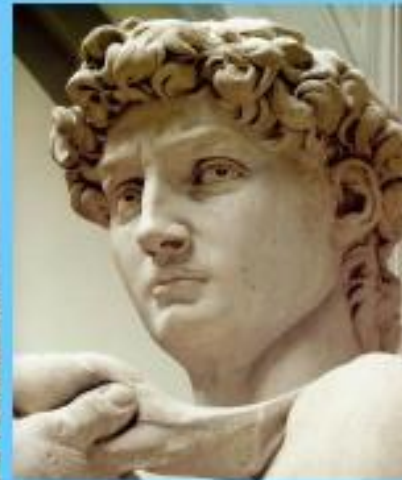
David by Michelangelo