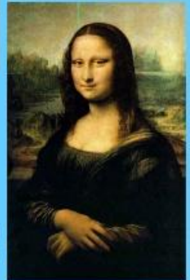
Mona Lisa by da Vinci