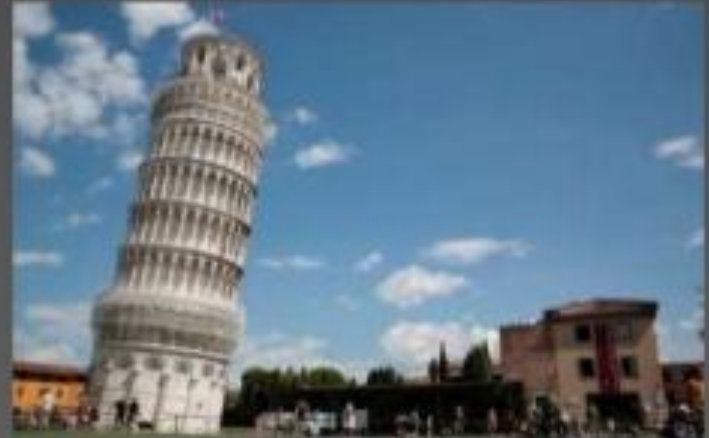
Tower of Pisa