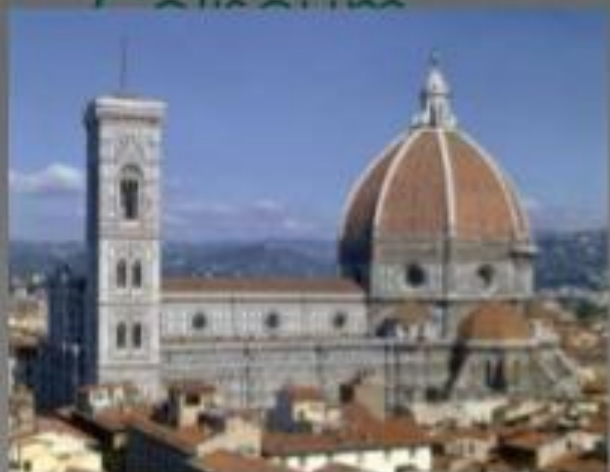
Santa María de Fiore