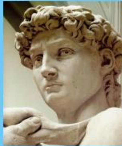
David by Michelangelo