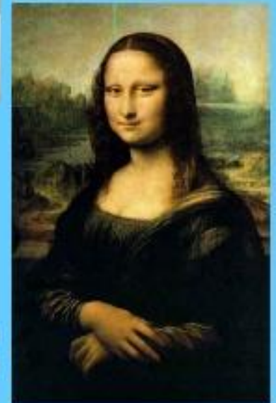
Mona Lisa by da Vinci