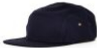
CAP=£3 (EVERY COLOR)