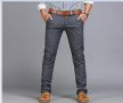
TROUSERS=£35 (GRAY, BLACK, BLUE)