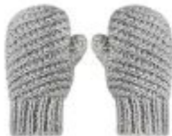
MITTENS=£5 (EVERY COLOR)