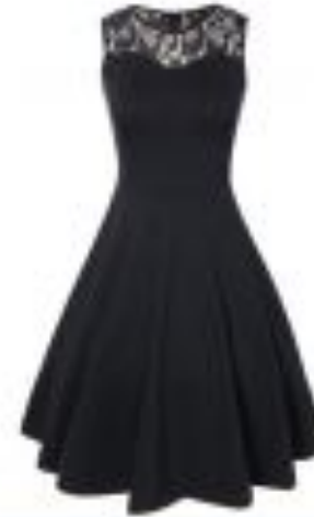
DRESS=£75 (BLACK,GREEN, BLUE,WHITE,RED)