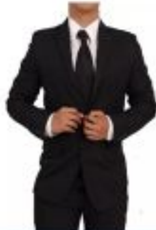
SUIT=£150 (BLACK, BLUE, GRAY, MAROON)