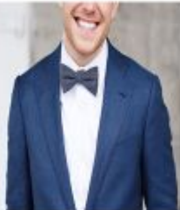
BOW TIE=£10 (BLACK,BLUE)