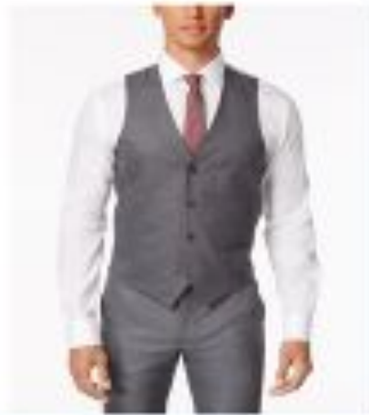
VEST=£45 (GRAY, BROWN, BLACK)