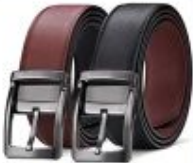
BELT=£10 (BLACK, BROWN)