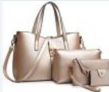
PURSE=£25 (EVERY COLOR)