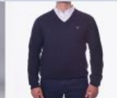
JUMPER=£30 (NAVY, GREEN, BLACK)