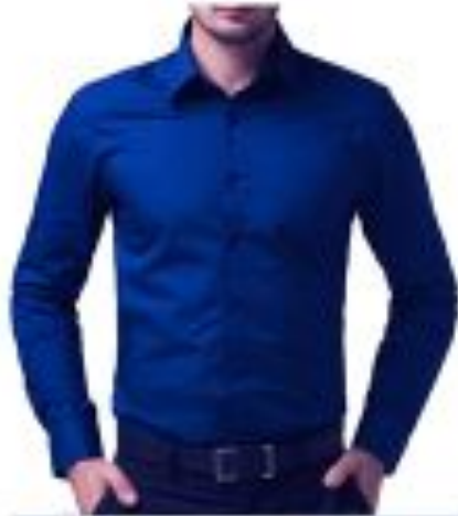
SHIRT=£25 (BLUE, GREEN, WHITE)