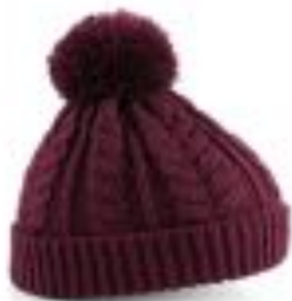
KNIT CAP=£10 (EVERY COLOR)