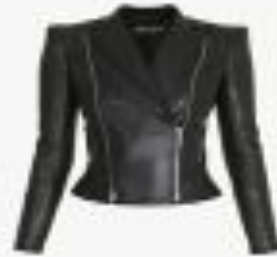
LEATHER JACKET=£50 (BLACK)