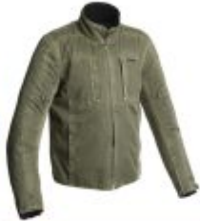
JACKET=£80 (GRAY, BLACK, GREEN)