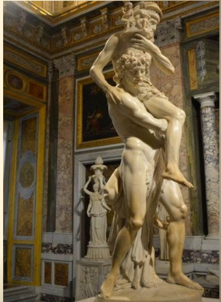
«Aeneas, Anchises and Ascanius» 1618-1619 years