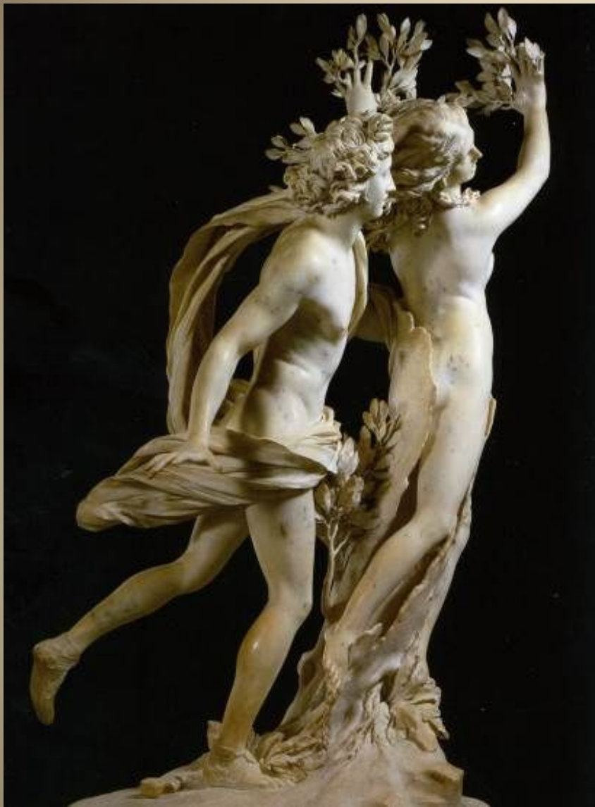
«Apollo and Daphne» 1622-1625 years