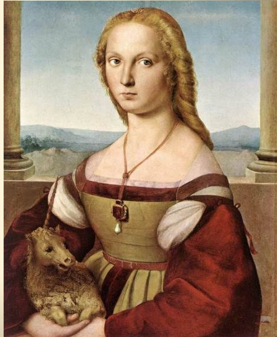
«The Lady with the Unicorn» Raphael 1505-1507 years