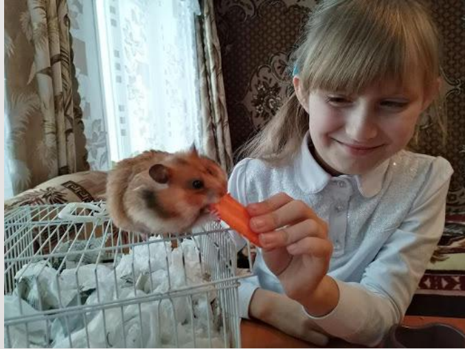
The girl's hamster