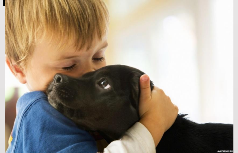
The boy's dog