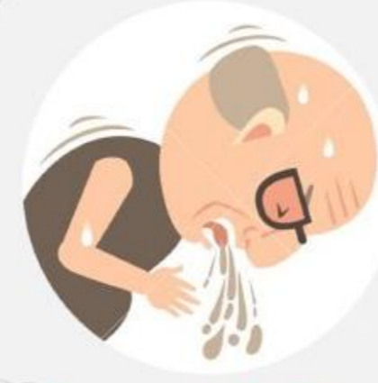
Nausea and Vomiting