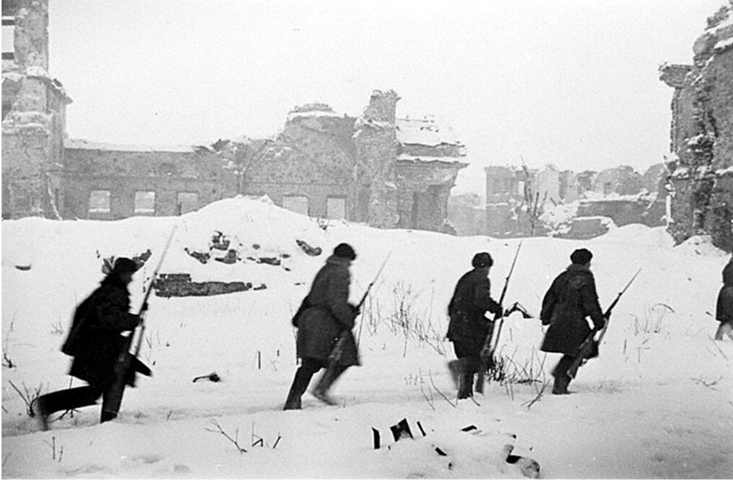
Defense of the fortress in world War II