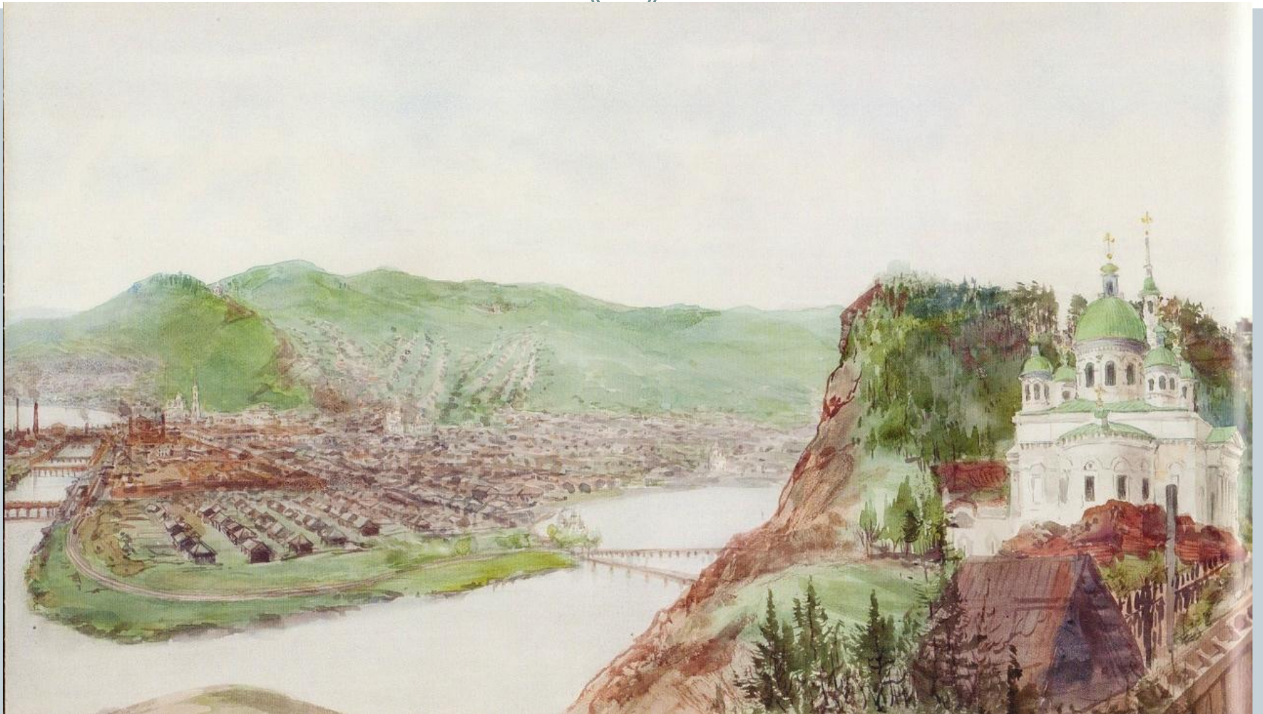
The panorama of Zlatoust of 1896 by Pavel Pecetsky.