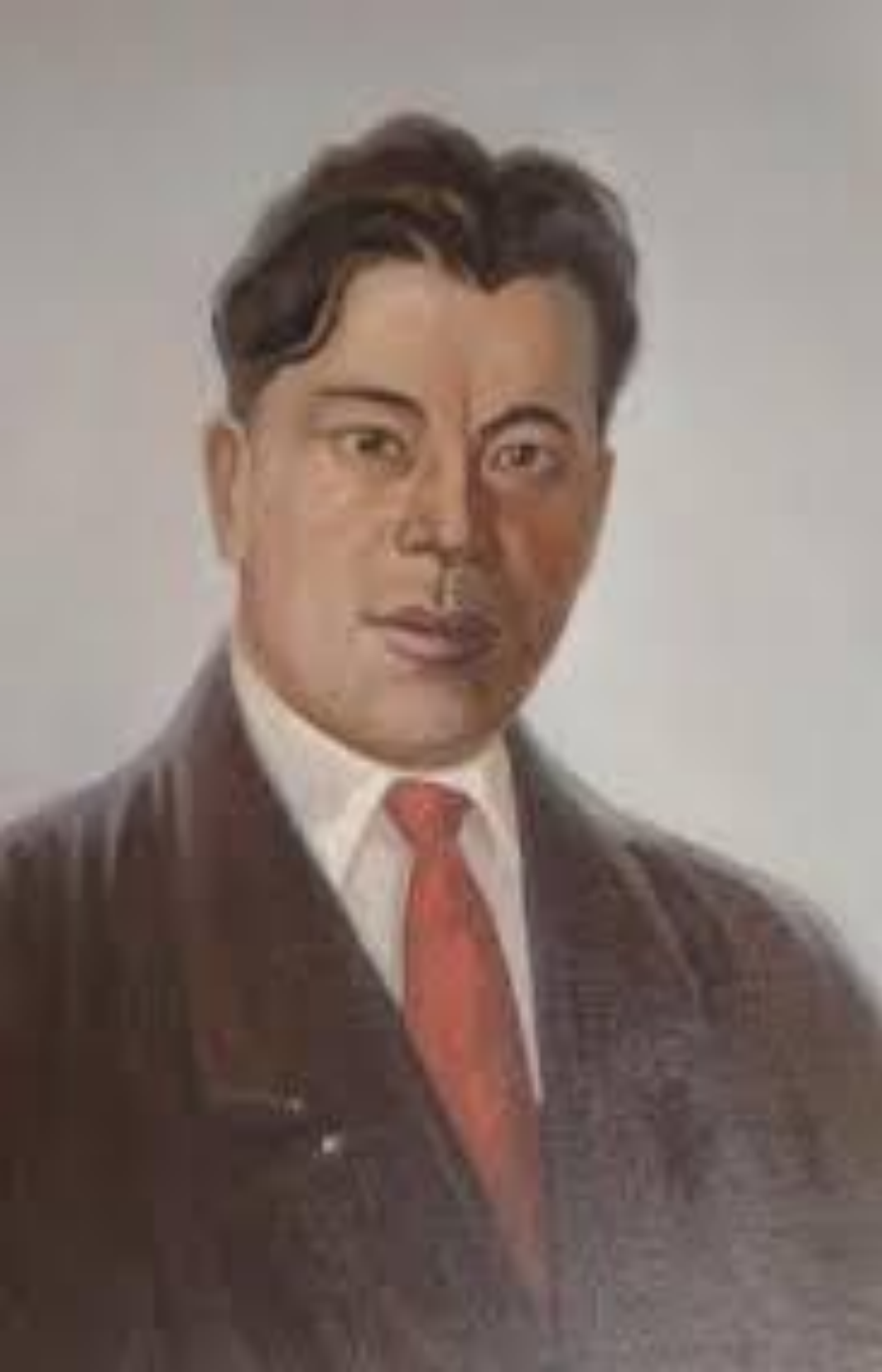
Beimbet Jarmagambetuli Maylin (15.11.1894- 10.11.1938)