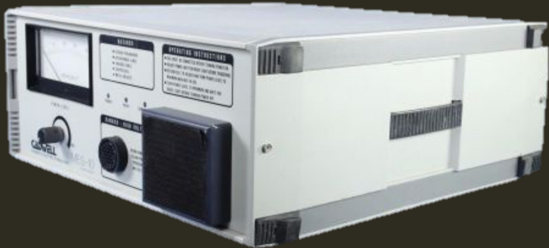
Cadwell Model MES10