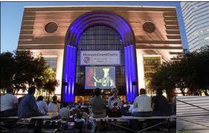
Houston Grand Opera

Houston is one of only five American cities with permanent professional resident companies in all of the major performing arts disciplines: the Houston Grand Opera, the Houston Symphony Orchestra, the Houston Ballet, and The Alley Theatre.