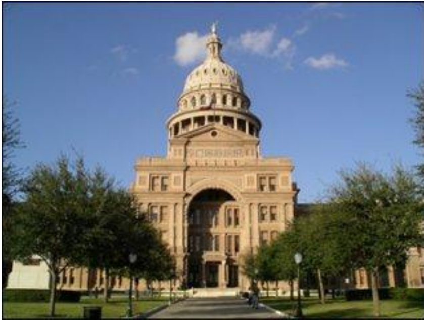
Texas A&M University in College Steyshene

Texas has over 1,000 school districts. In Texas, there are two leading universities of the country - University of Texas at Austin and Texas A&M University in College Steyshene. Also in Texasare a lot of medical institutions of high level.