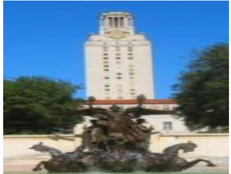
University of Texas at Austin