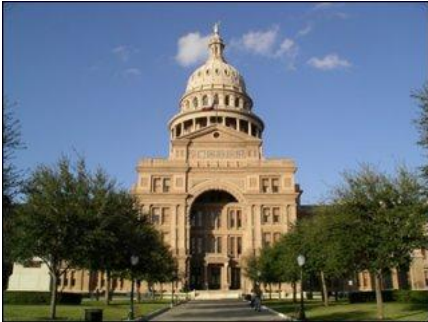
Texas A&M University in College Steyshene

Texas has over 1,000 school districts. In Texas, there are two leading universities of the country - University of Texas at Austin and Texas A&M University in College Steyshene. Also in Texasare a lot of medical institutions of high level.