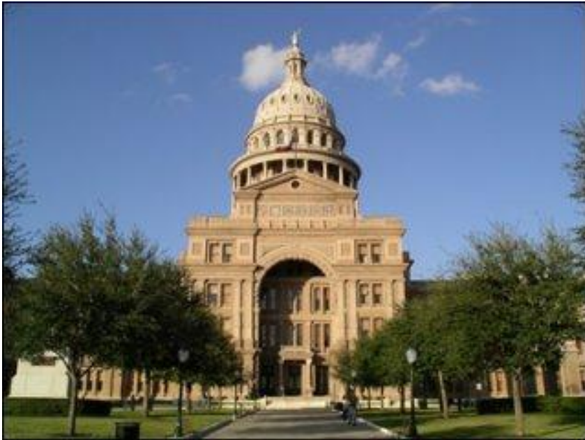
Texas A&M University in College Steyshene

Texas has over 1,000 school districts. In Texas, there are two leading universities of the country - University of Texas at Austin and Texas A&M University in College Steyshene. Also in Texasare a lot of medical institutions of high level.