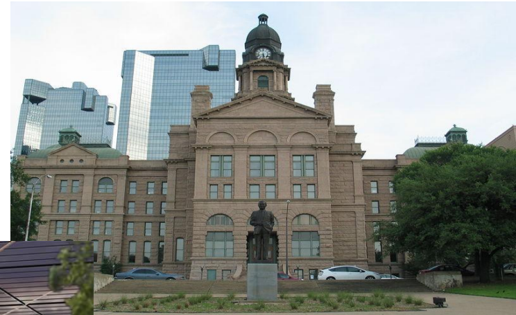
Amon Carter Museum