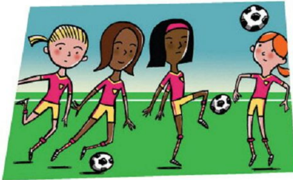
4. play on the soccer team