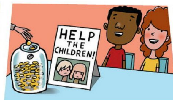
6. collect money for charity