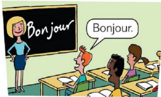
5. learn a new language