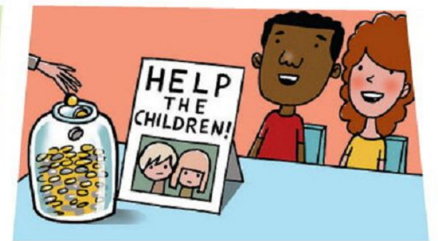
6. collect money for charity