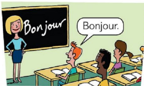
5. learn a new language