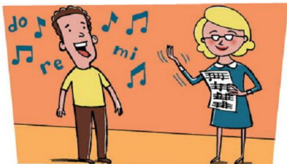
1. take singing lessons