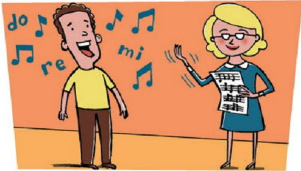
1. take singing lessons