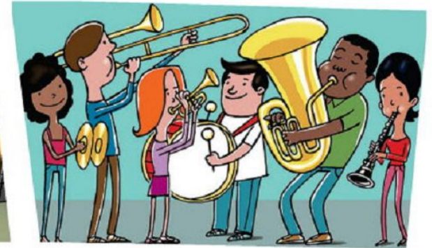
3. play in the school band