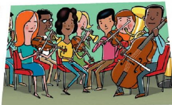
2. play in the school orchestra