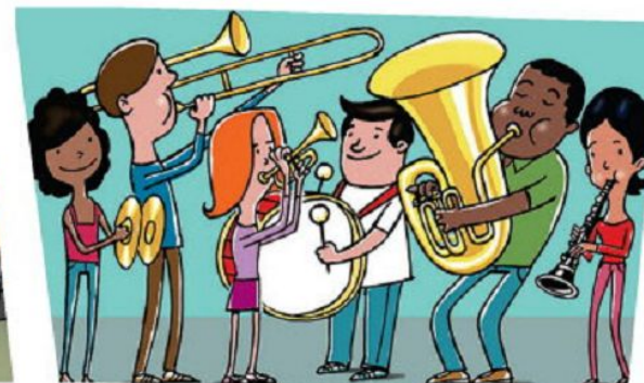
3. play in the school band