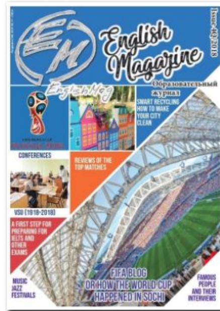
4Q/2018 FIFA Blog