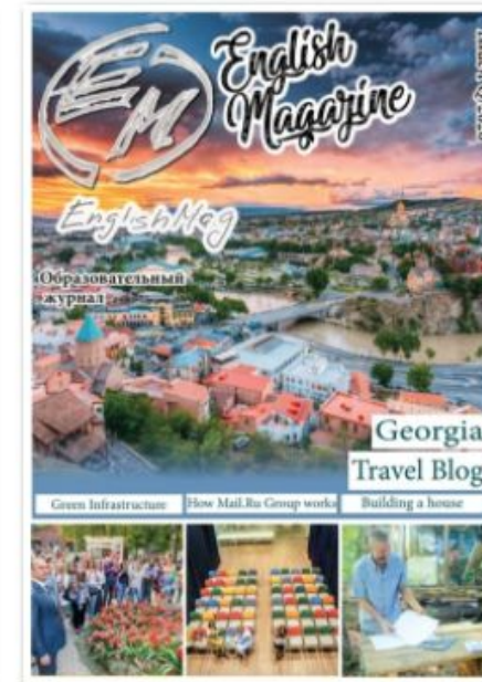
1Q/2020 Georgia Blog