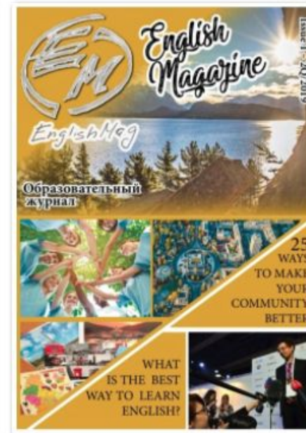
2Q/2019 Patagonia Blog