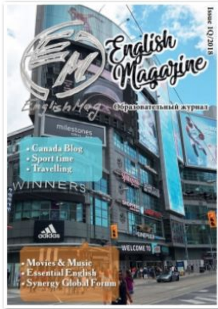
1Q/2018 Canada Blog

Читайте наш журнал в бумажной или электронной версии!