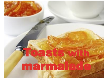
Toasts with marmalade