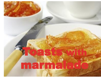
Toasts with marmalade