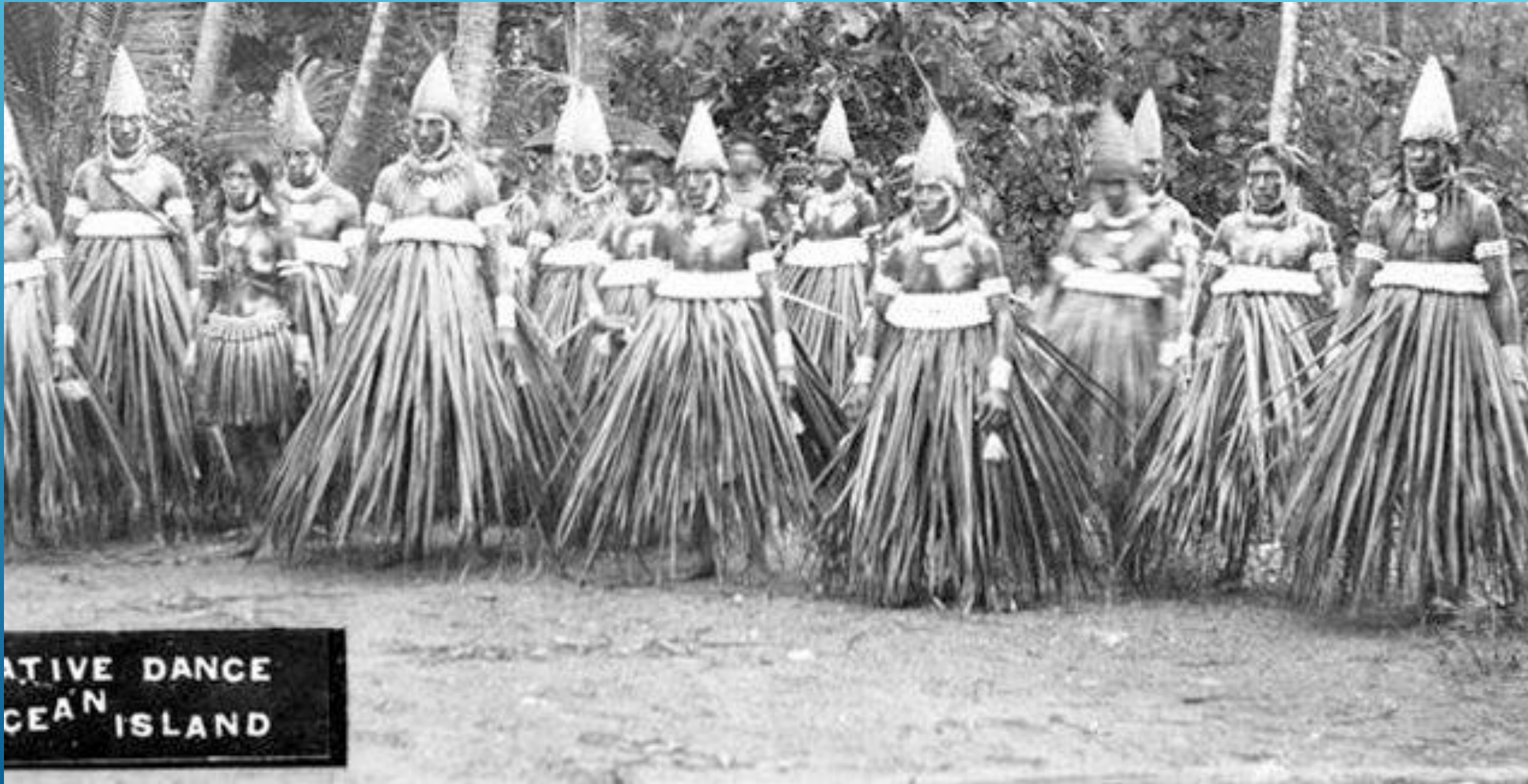
TRADITIONAL DANCE OCEAN ISLAND