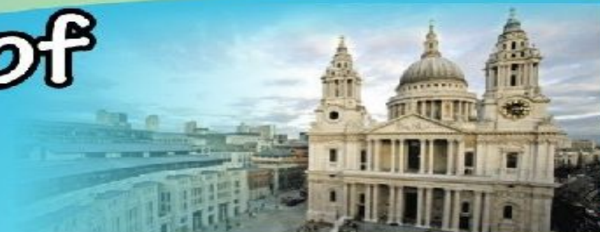
St. Paul's Cathedral