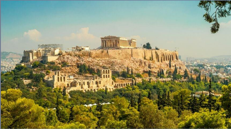
The Acropolis of Athens