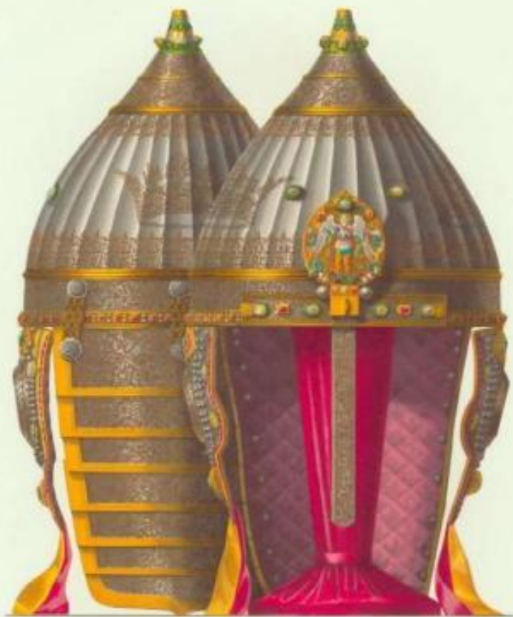
ШЛЕМЪ Б. К. АЗЕРКАЛАТА ИЕВСКАГО.