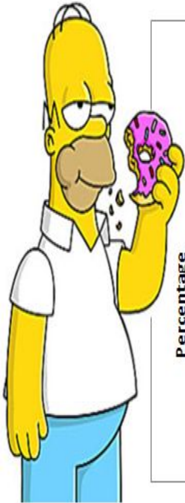
Graph 1. Prevalence of Overweight Population in the United States