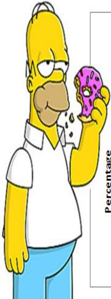
Graph 1. Prevalence of Overweight Population in the United States