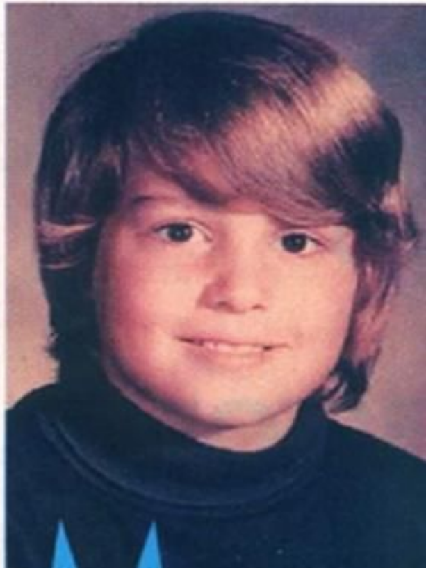
Johnny Depp Patrick Swayze Adam Sandler