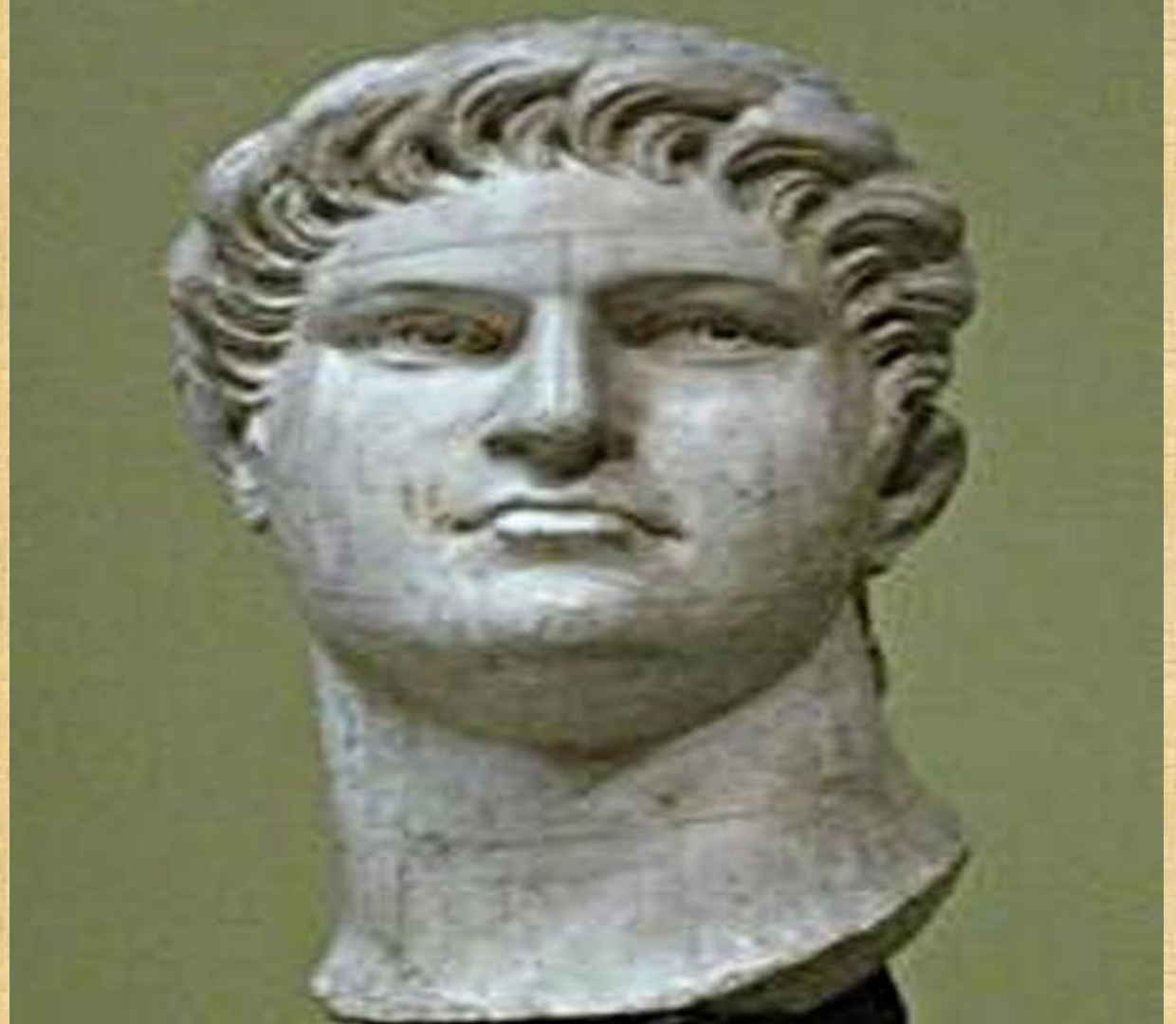
Gnay Julius Agricola