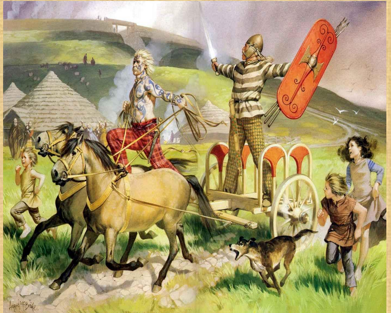
confrontation between the Celts and Romans