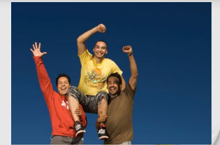
Defender of the Fatherland Day