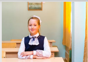
Day of Knowledge