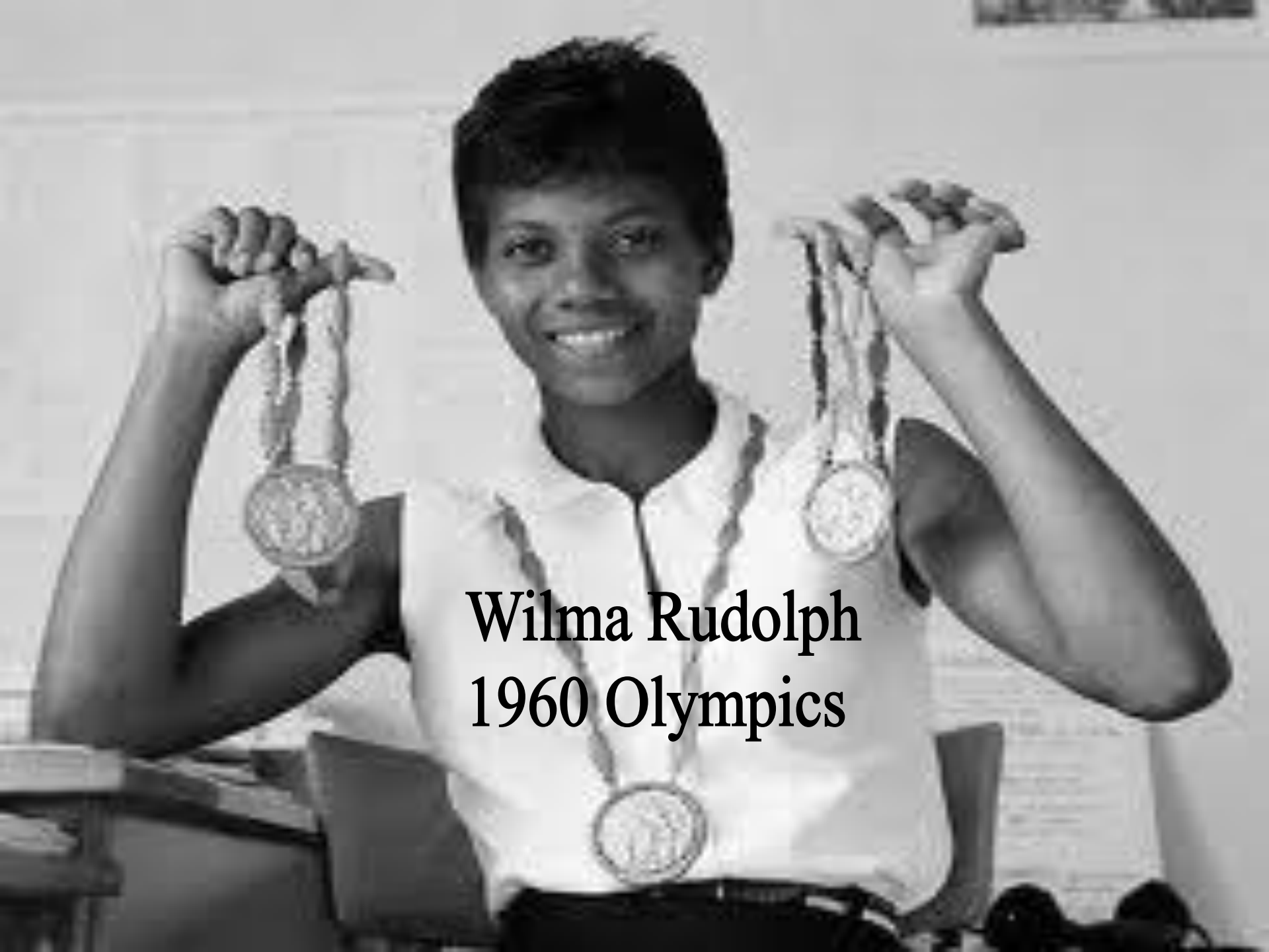
Wilma Rudolph 1960 Olympics