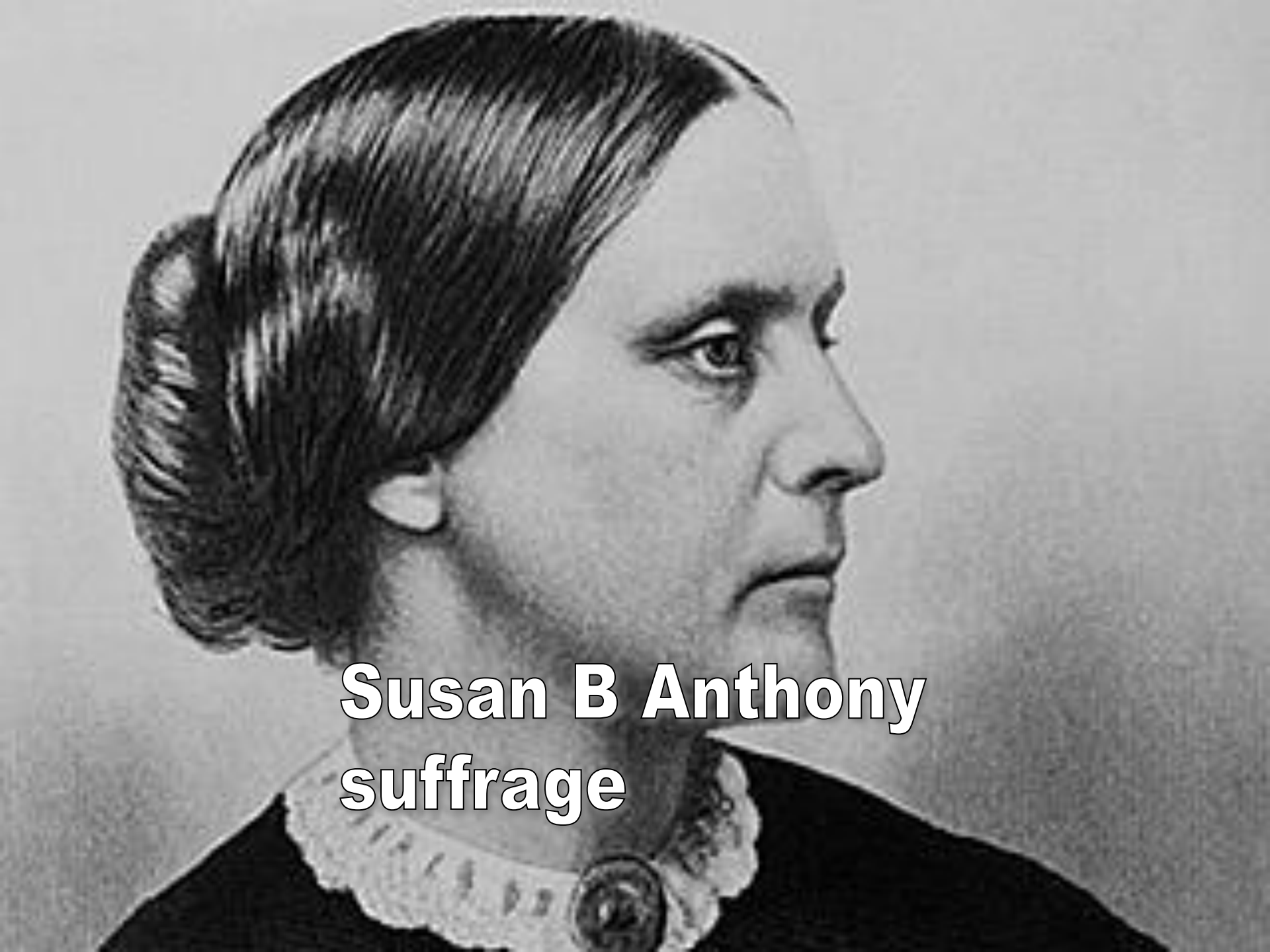
Susan B Anthony suffrage