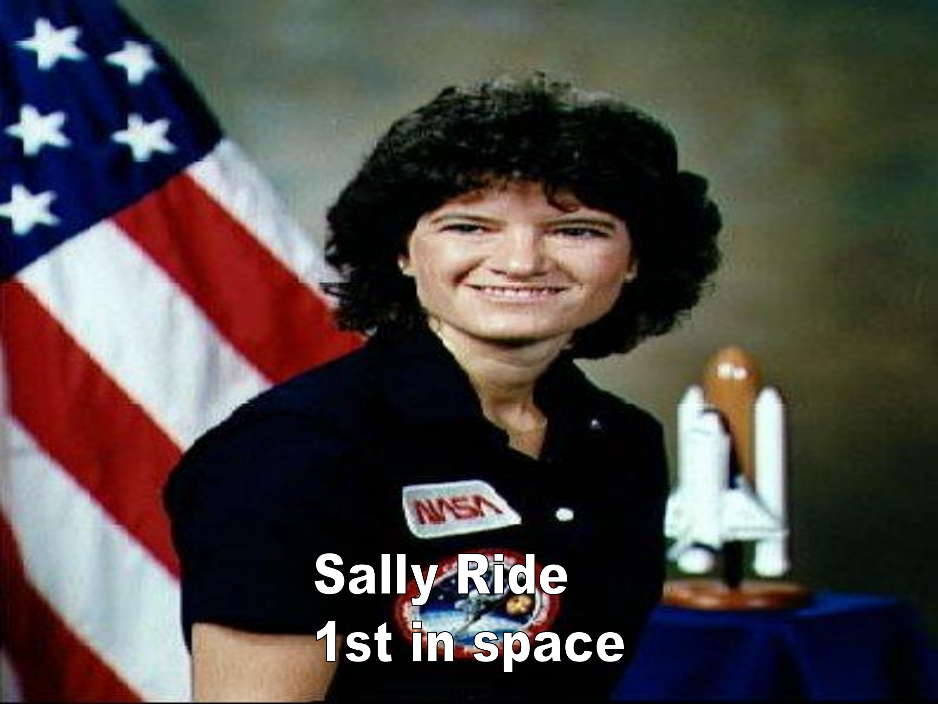
Sally Ride 1st in space