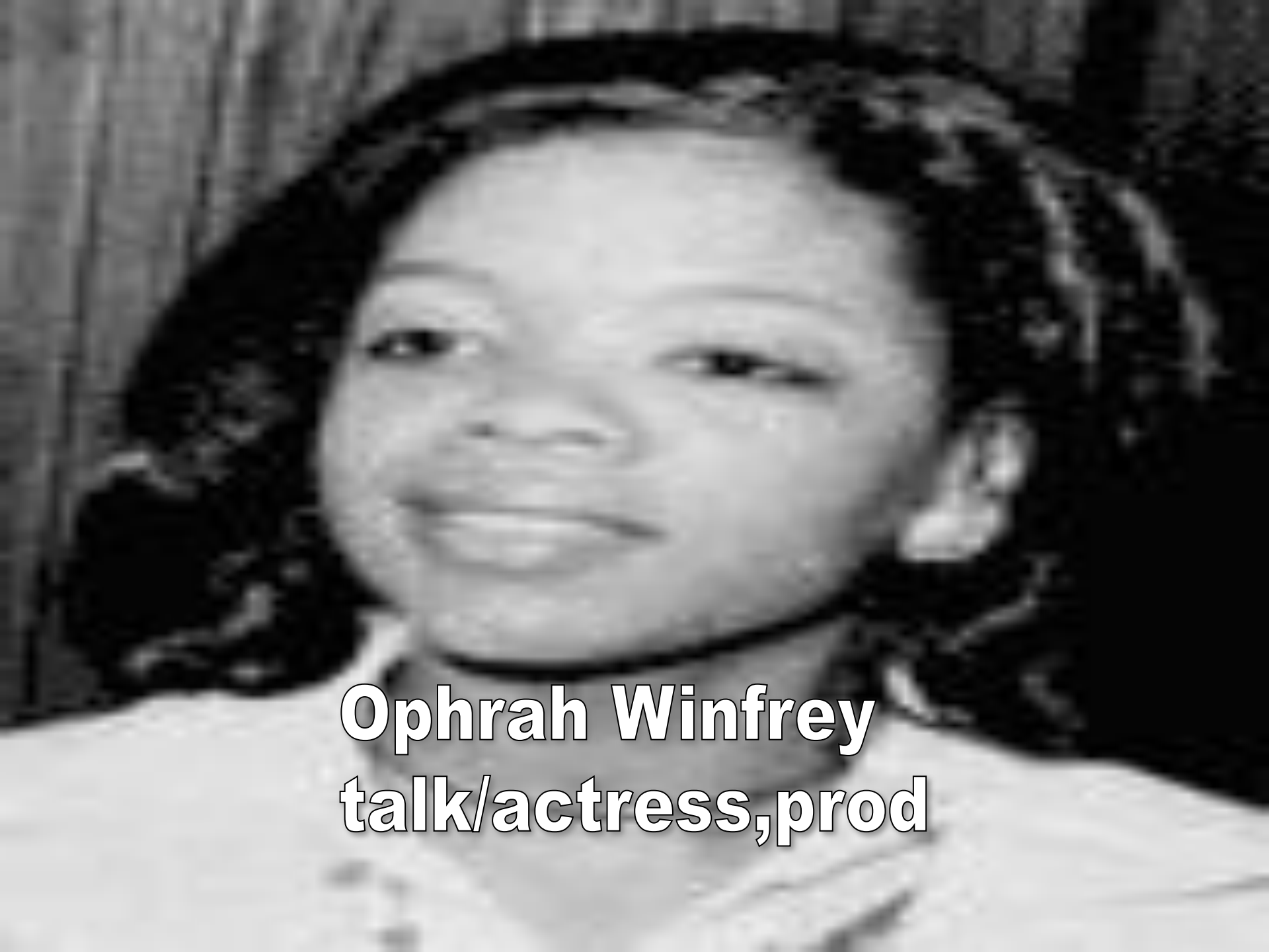
Ophrah Winfrey talk/actress,prod