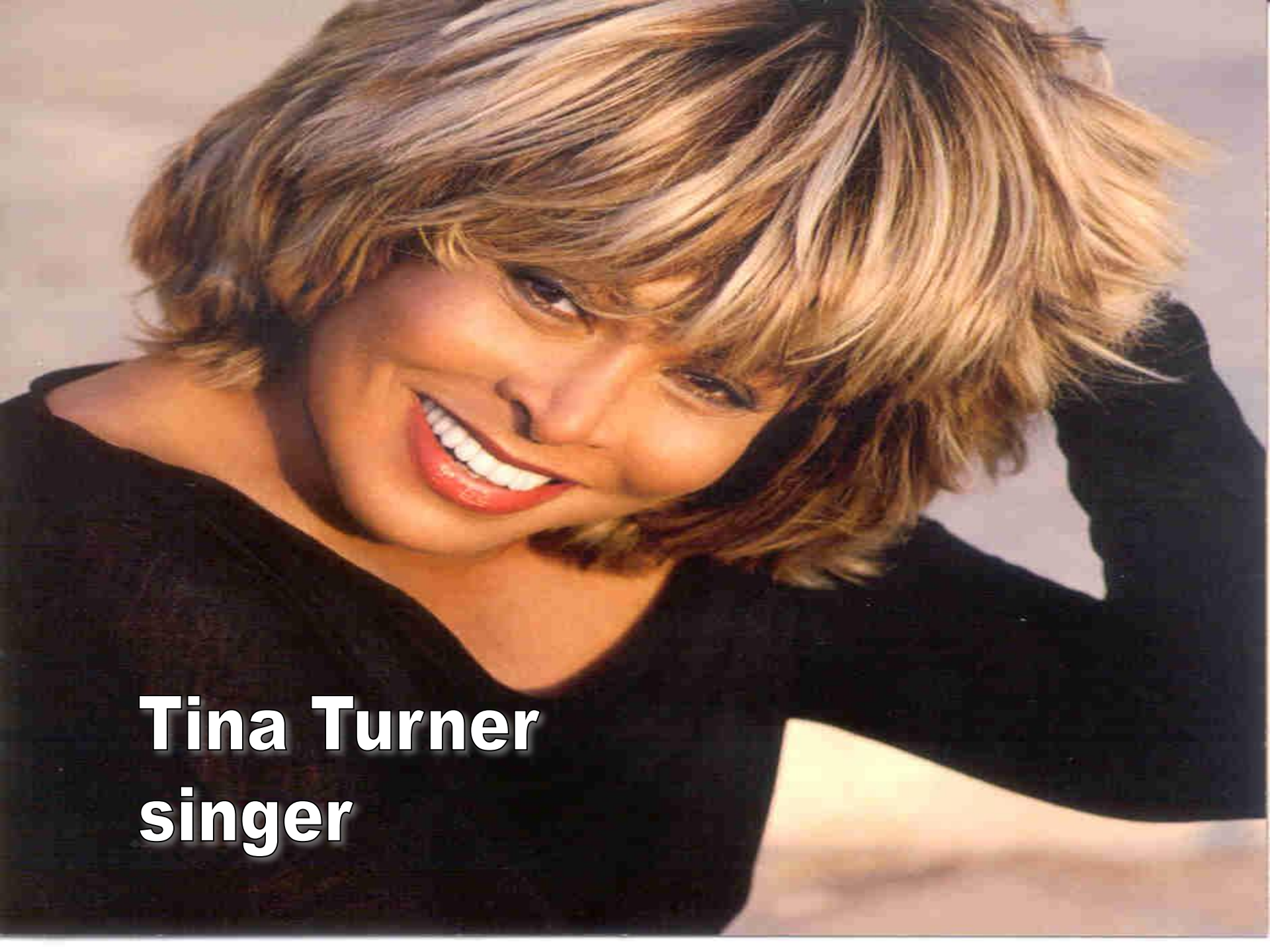
Tina Turner singer