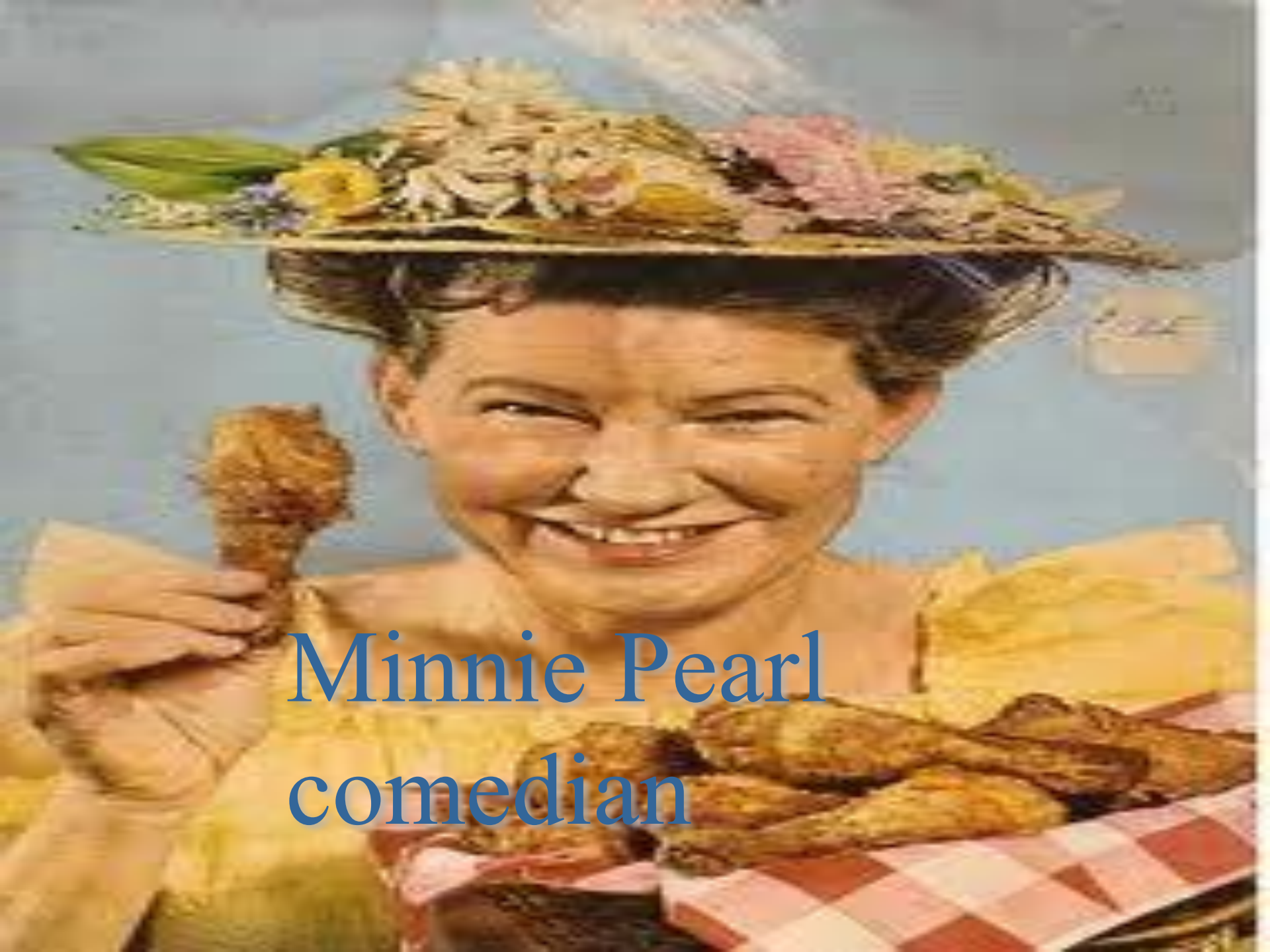
Minnie Pearl comedian