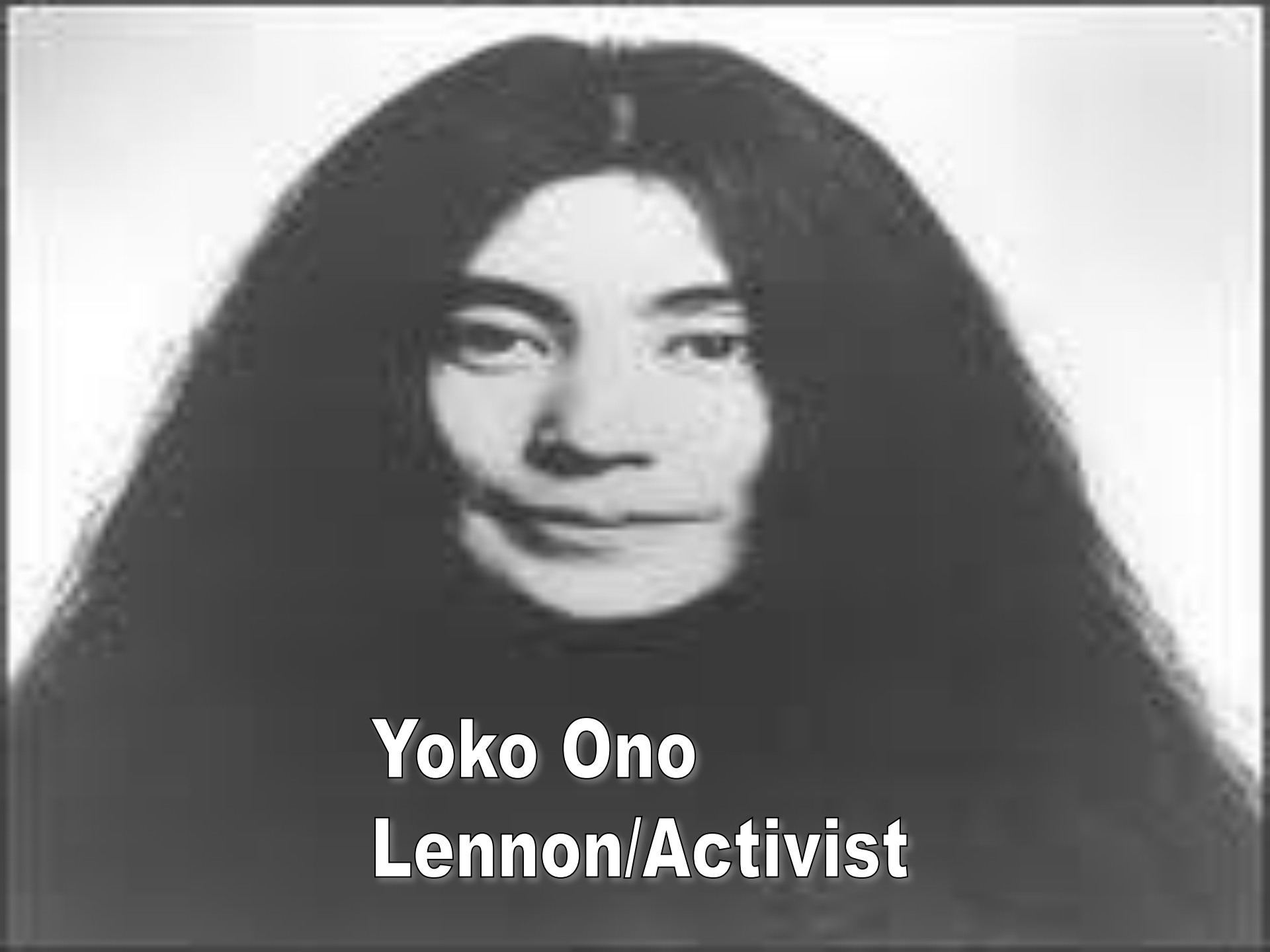
Yoko Ono Lennon/Activist