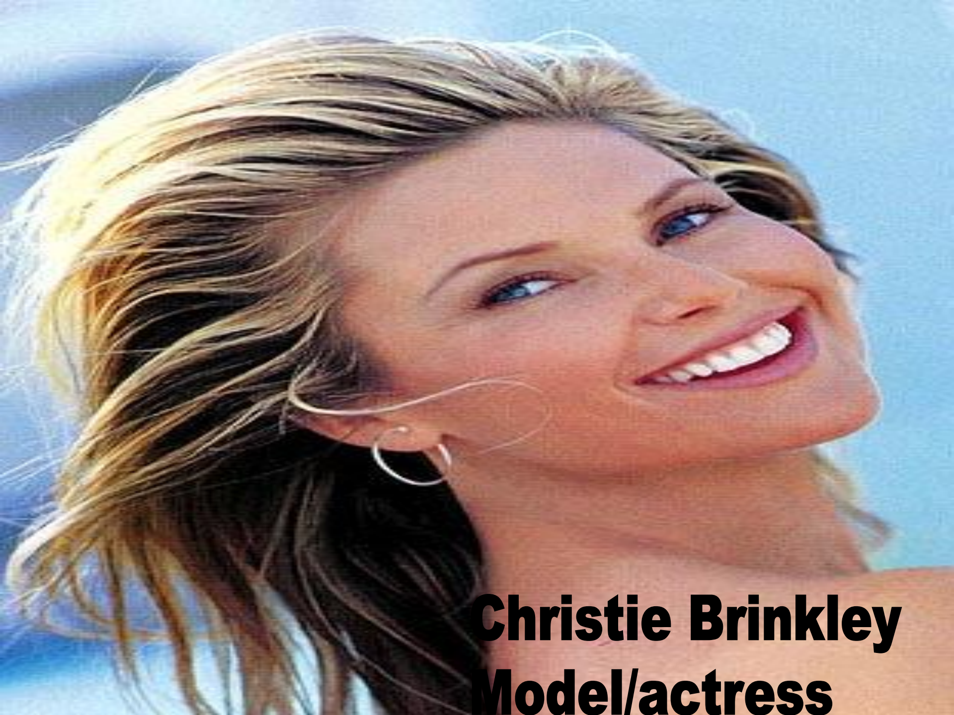
Christie Brinkley Model/actress