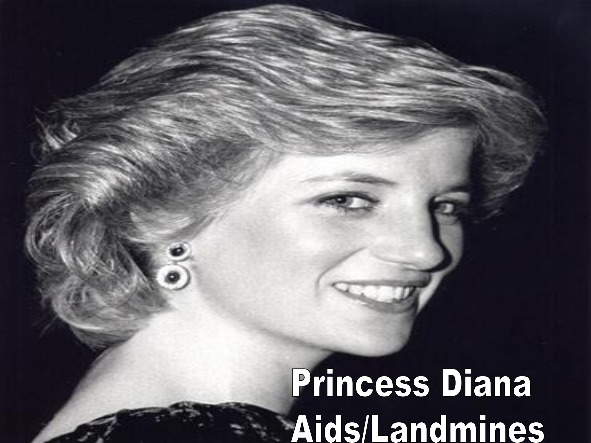
Princess Diana Aids/Landmines