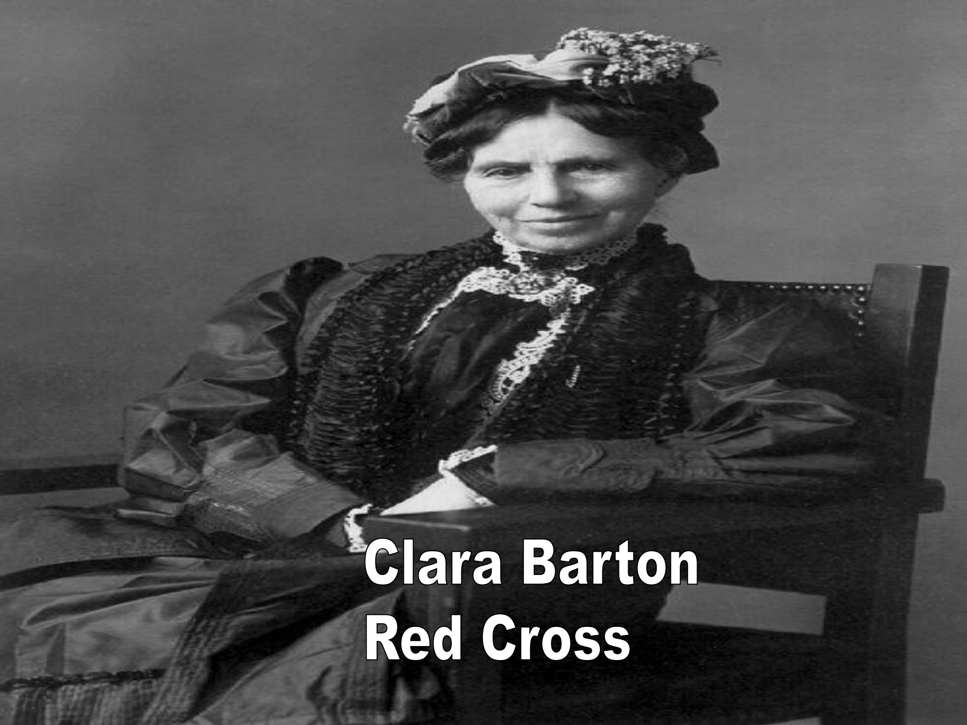
Clara Barton Red Cross