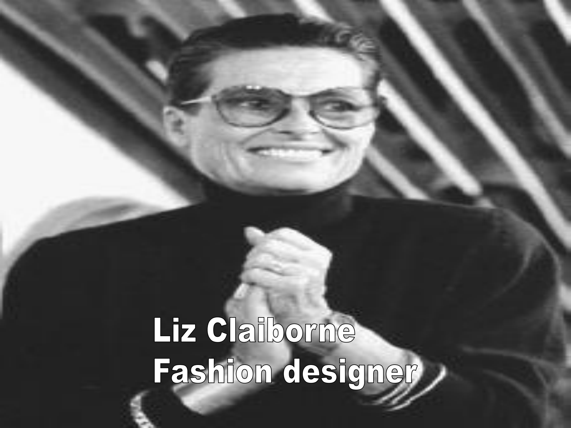
Liz Claiborne Fashion designer