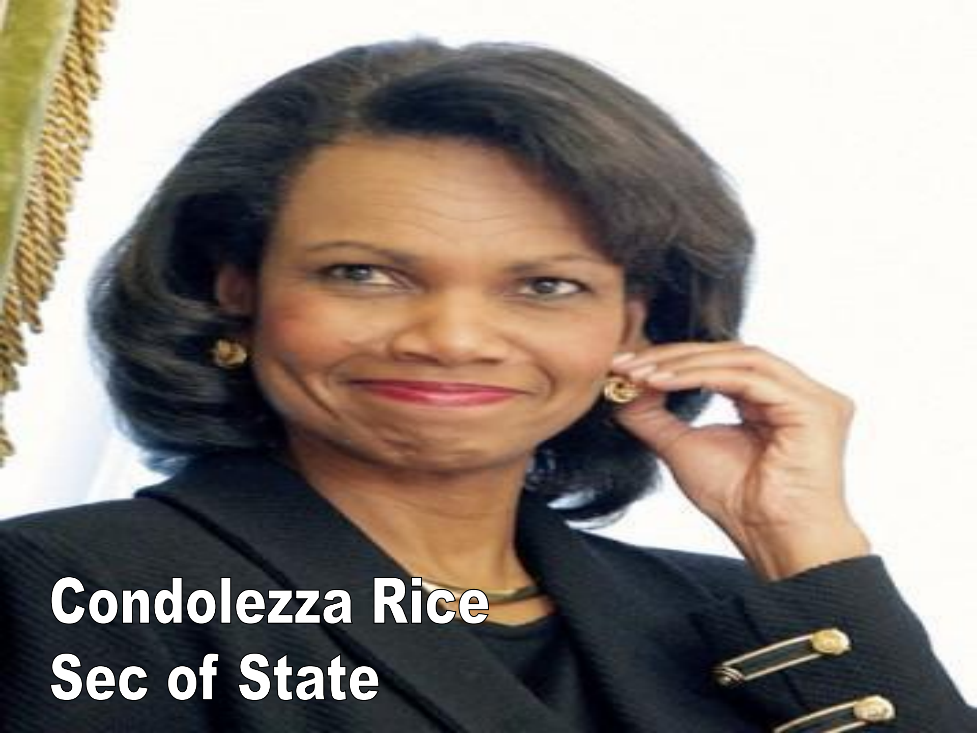
Condoleezza Rice Sec of State