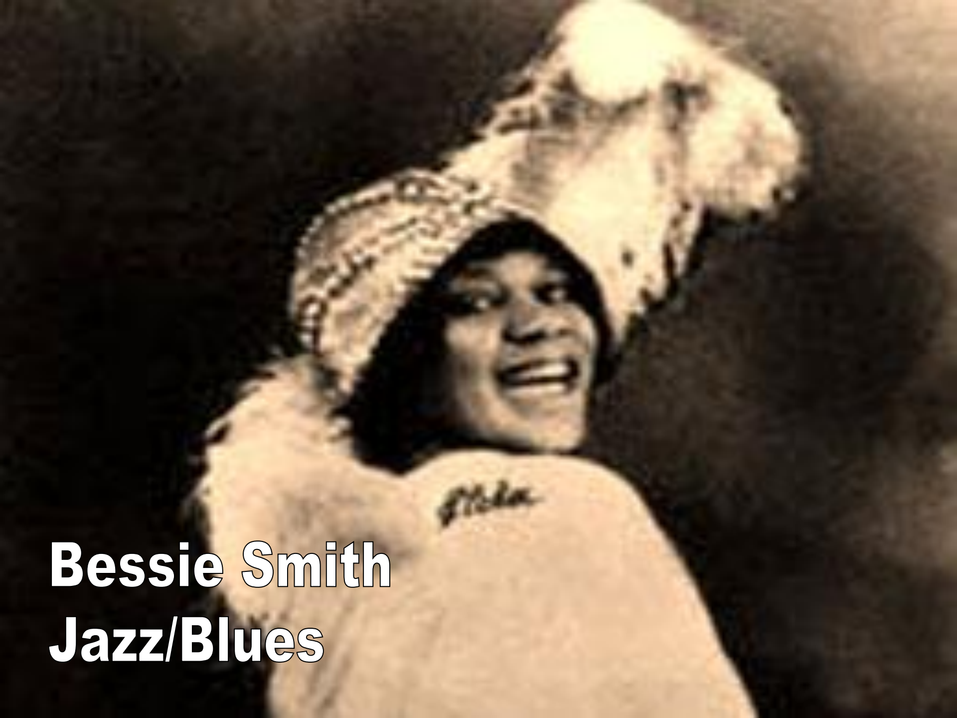
Bessie Smith Jazz/Blues