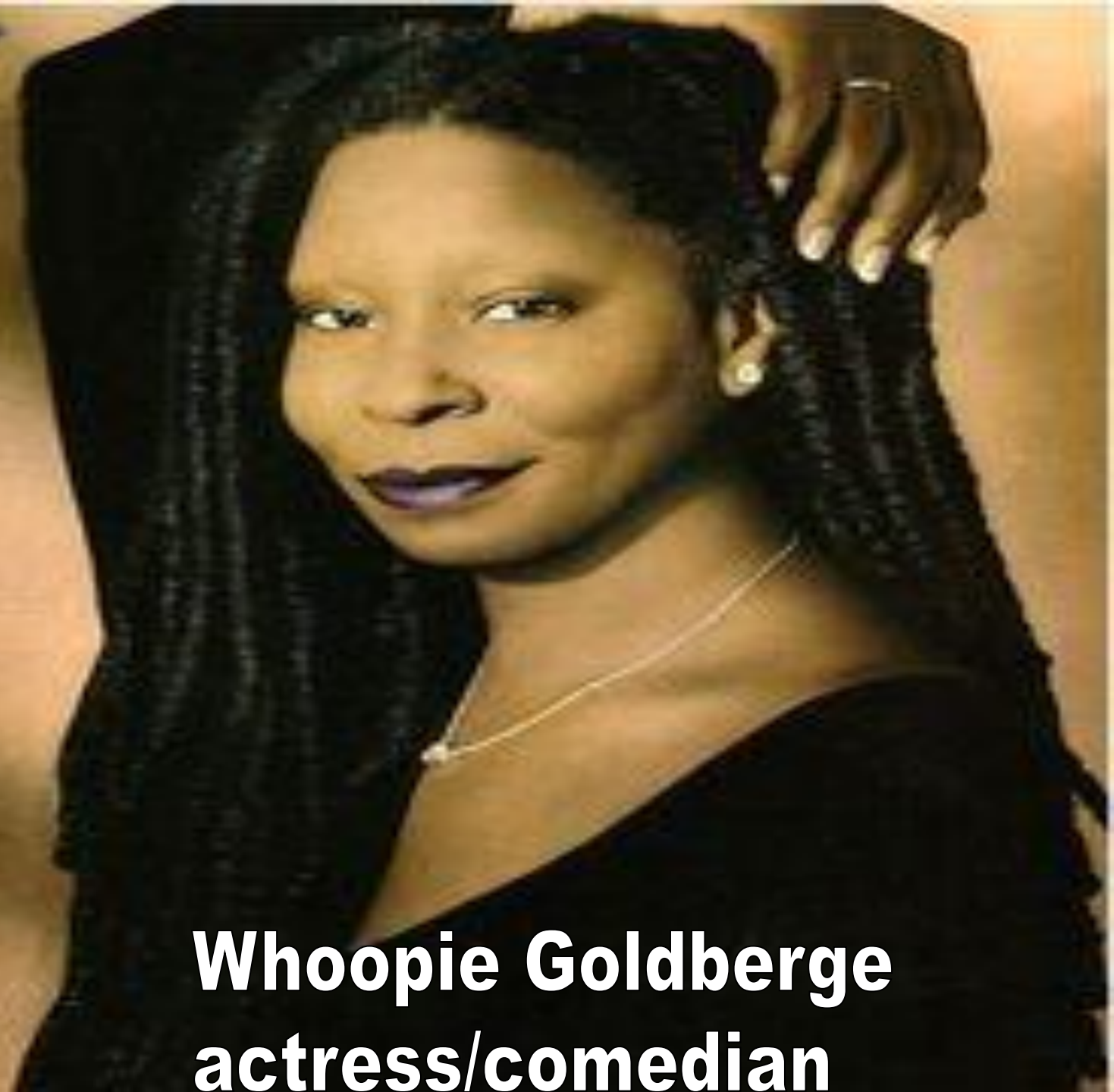
Whoopi Goldberge actress/comedian