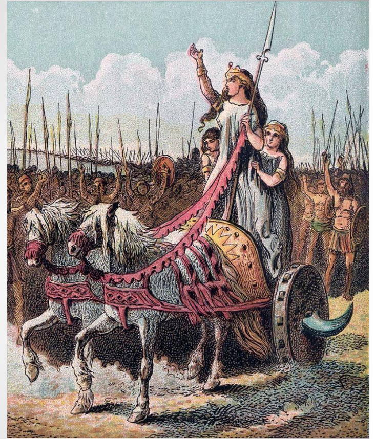
Boudicca calls on people to revolt, 61