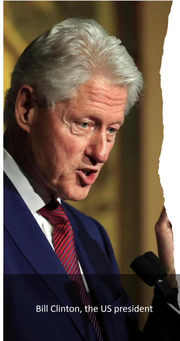
Bill Clinton, the US president