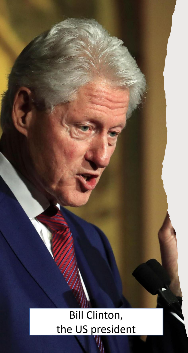
Bill Clinton, the US president