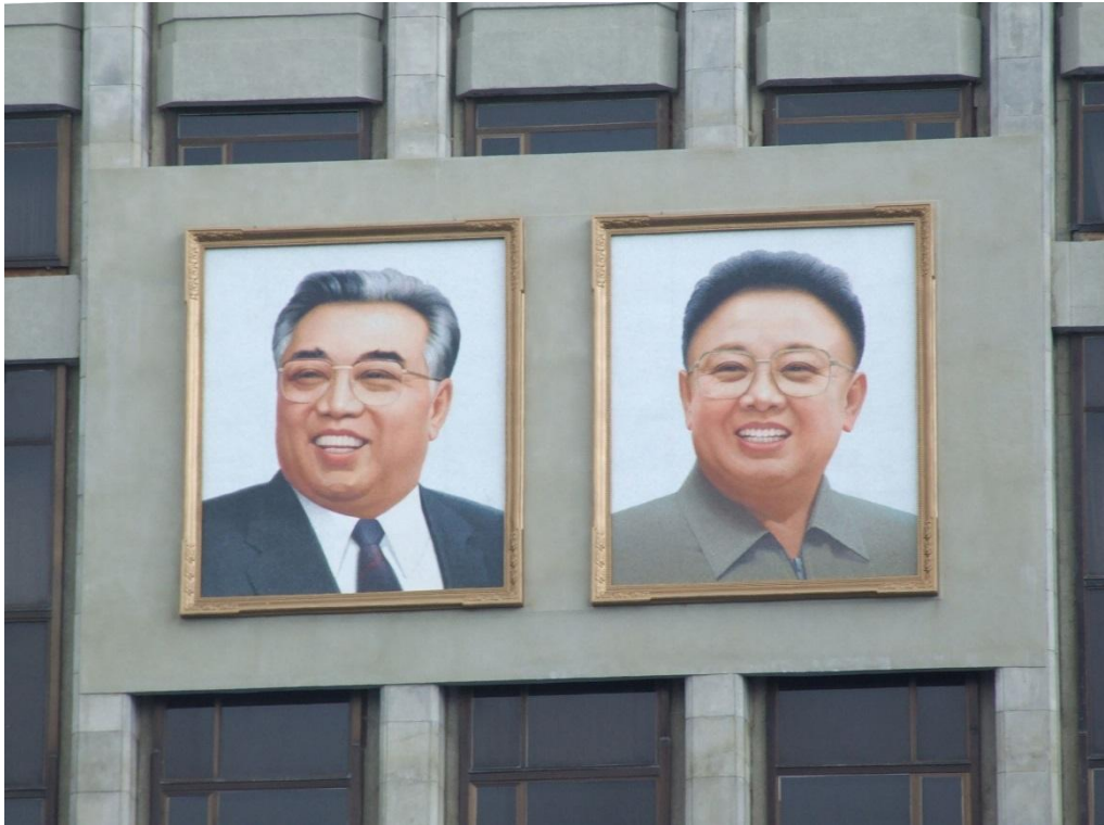
Portraits of the Eternal President, Kim Il-sung, and the Eternal General Secretary of the Workers' Party, Kim Jong-il.