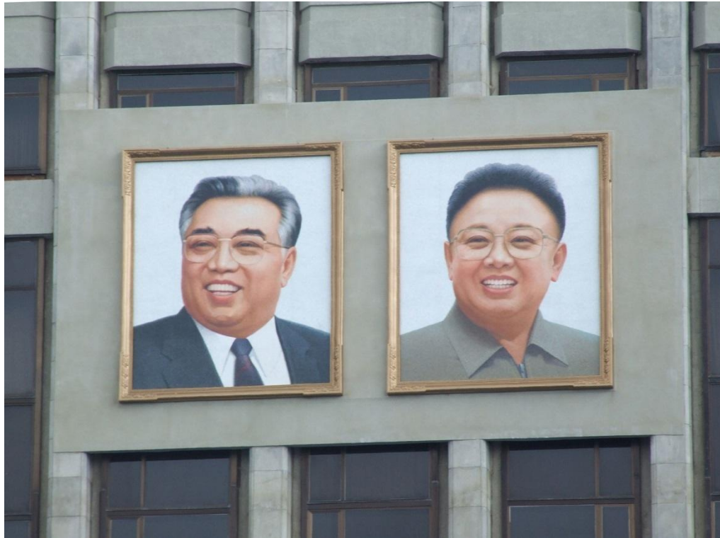
Portraits of the Eternal President, Kim Il-sung, and the Eternal General Secretary of the Workers' Party, Kim Jong-il.