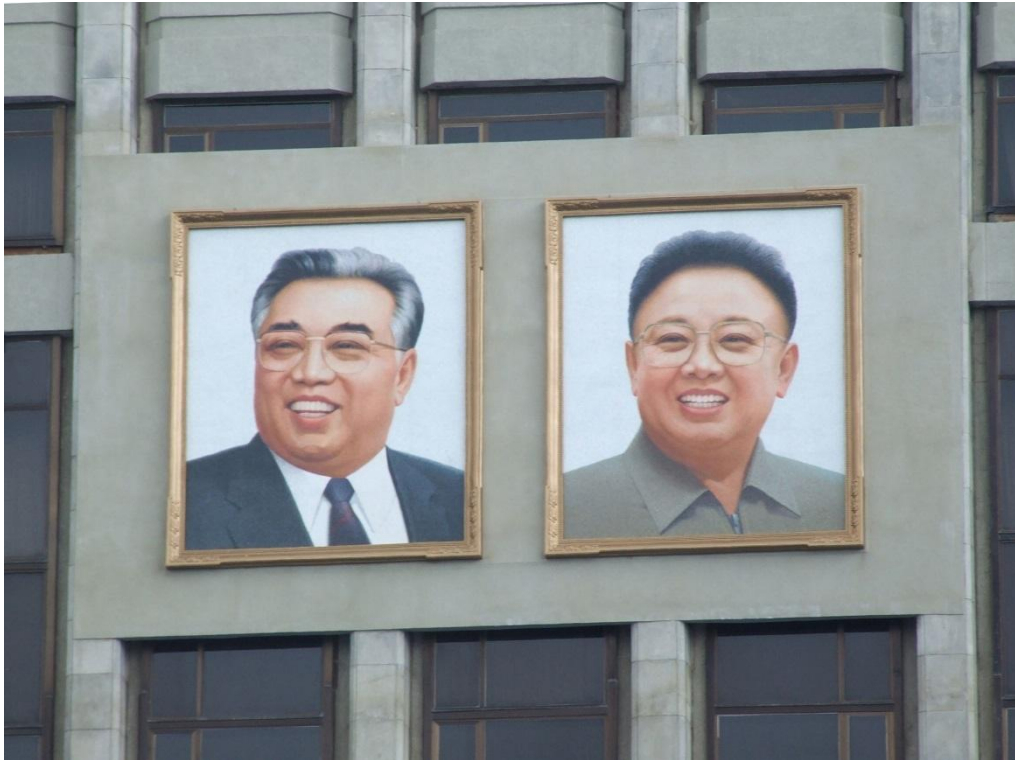
Portraits of the Eternal President, Kim Il-sung, and the Eternal General Secretary of the Workers' Party, Kim Jong-il.