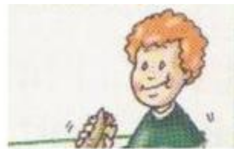
eat a hot dog