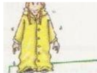
wear a mac