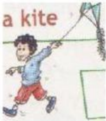
fly a kite