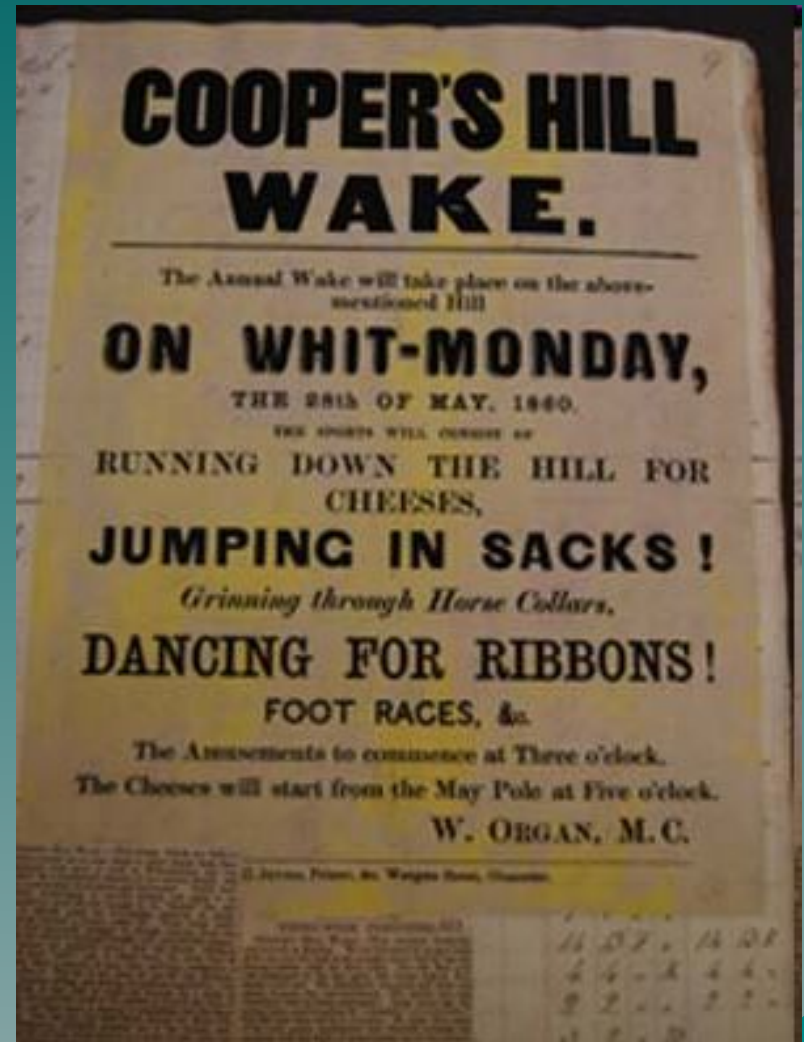
Cheese Rolling Poster from 1860