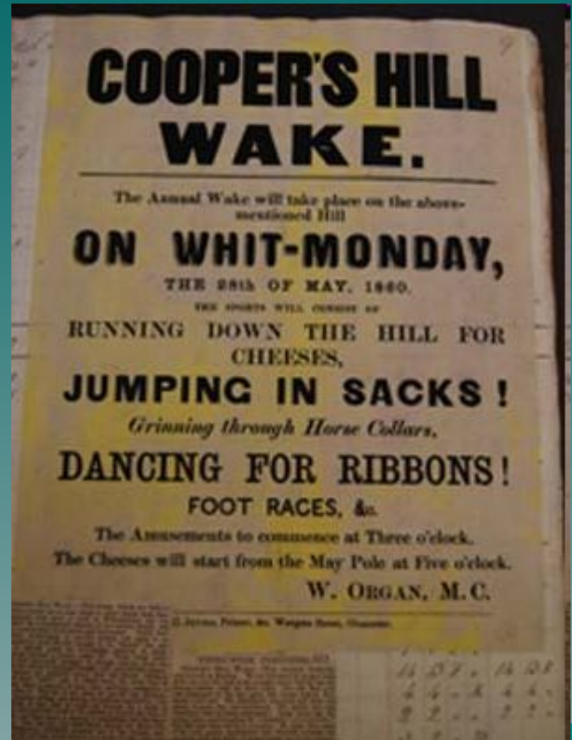
Cheese Rolling Poster from 1860