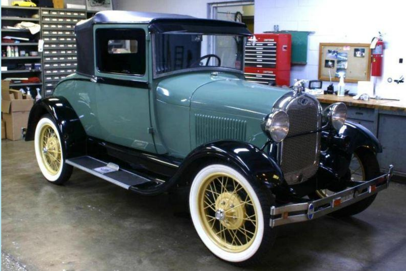
Ford Model A.