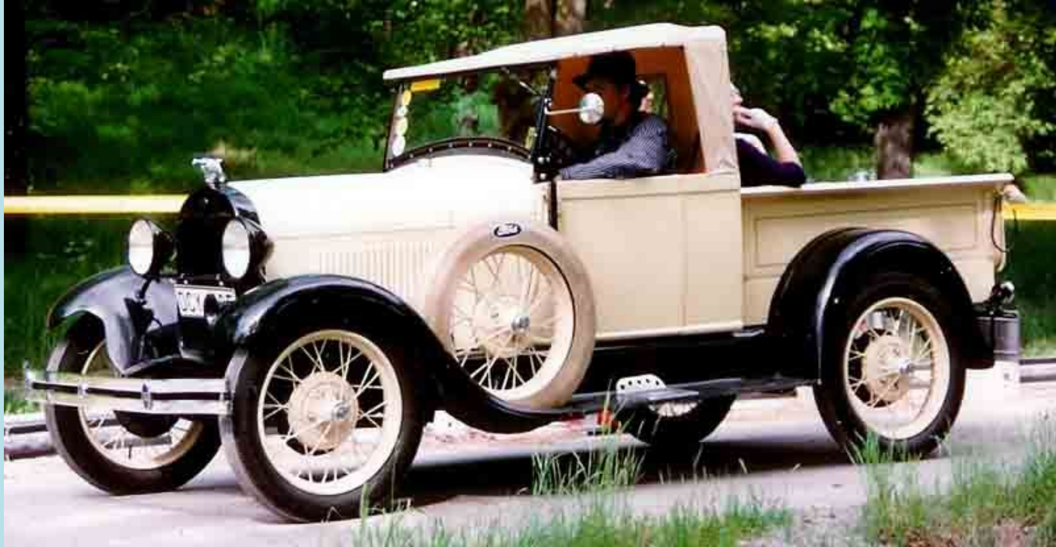
Ford Model A 1928 года с кузовом "бизнес-купе"