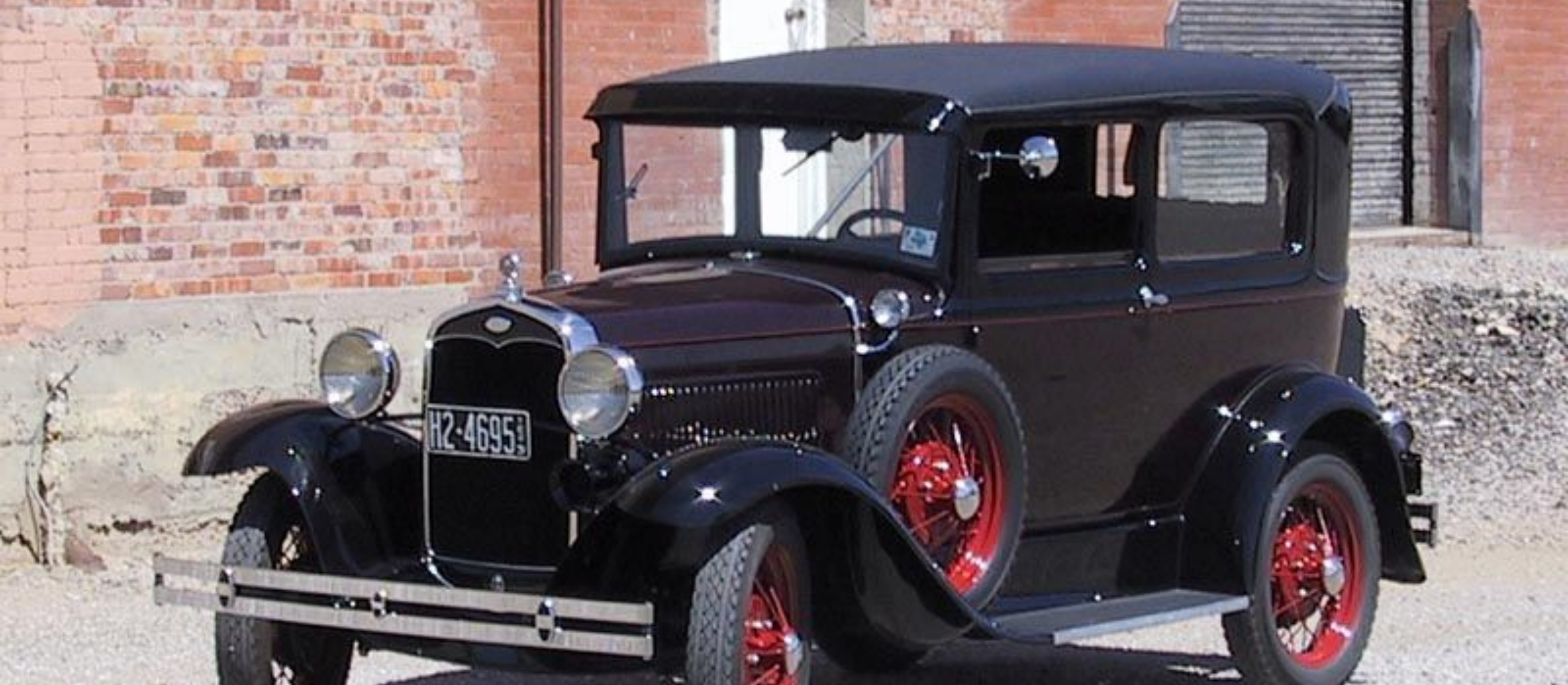
Ford Model A 1928 года с кузовом "пикап"