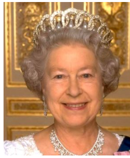
Queen Elizabeth II