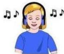
listening to music