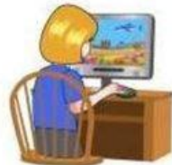
playing computer games