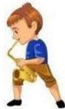
playing an instrument