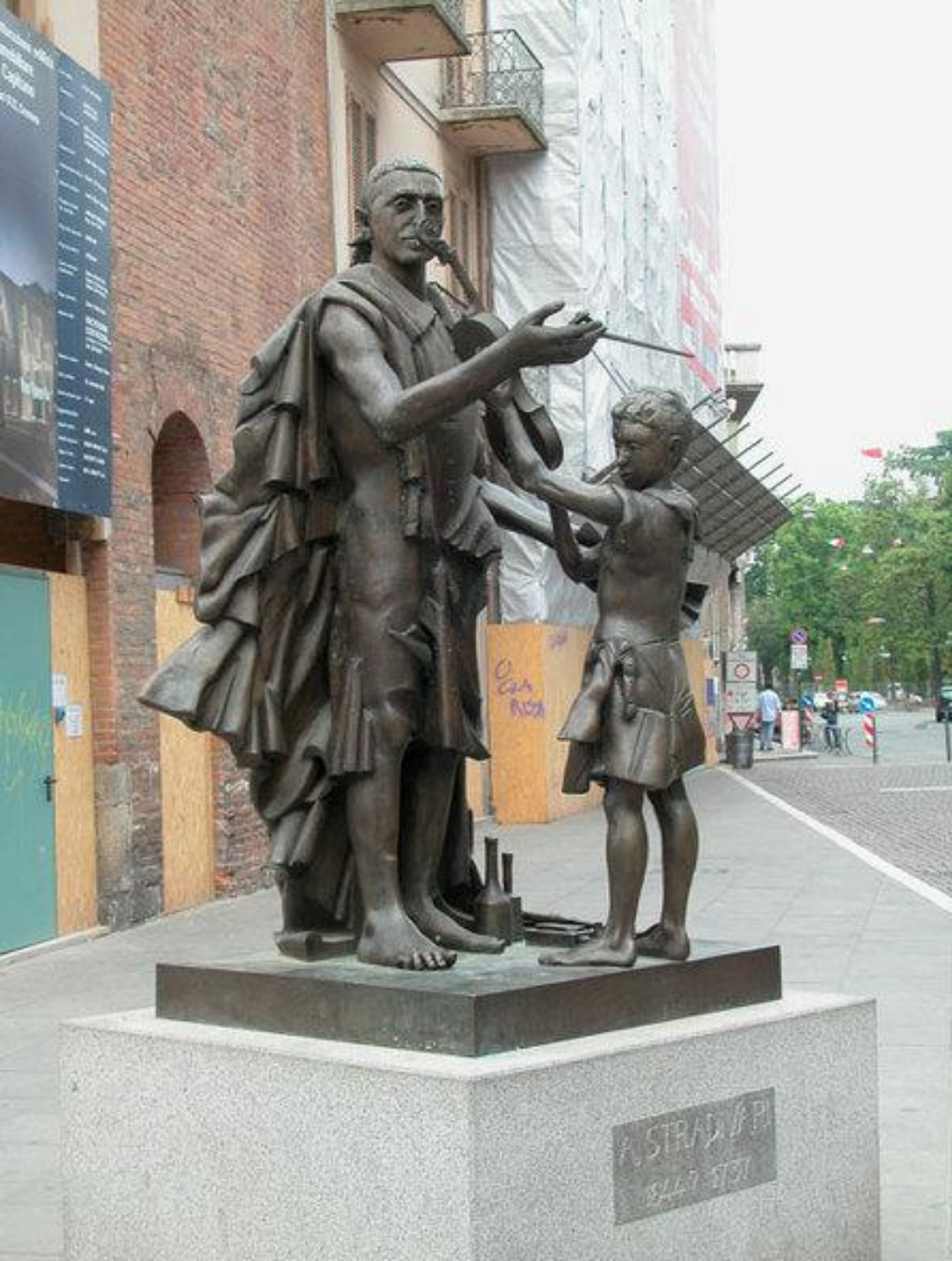
Monument Stradivari in Cremona, Italy