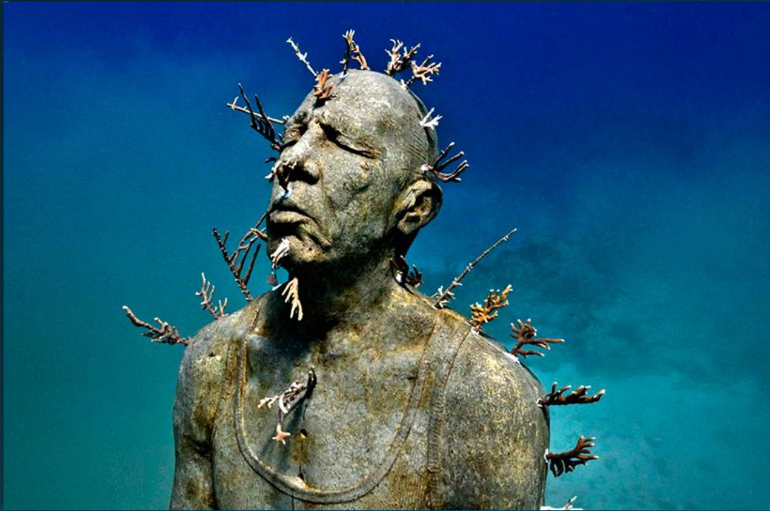
"Man on Fire"

Each exhibit was given an unique name, such as "Man on Fire", which has "fire" corals growing out of holes, "Dream Collector" or "Gardener Girl". And the largest composition is called "Quiet Revolution".