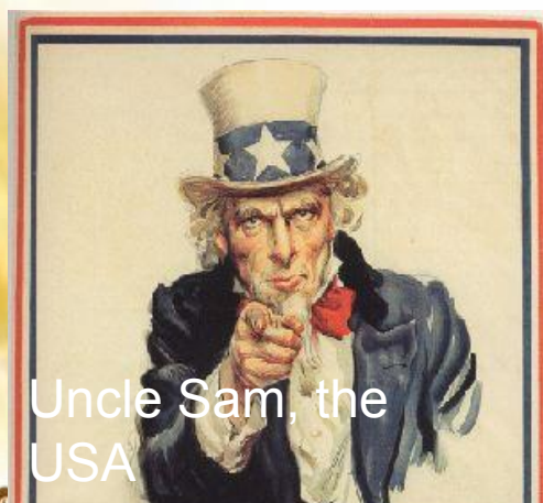
Uncle Sam, the USA