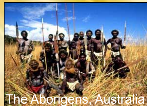
The Aborigens, Australia