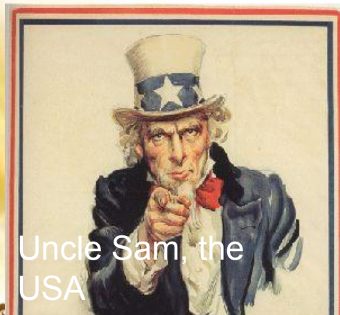
Uncle Sam, the USA