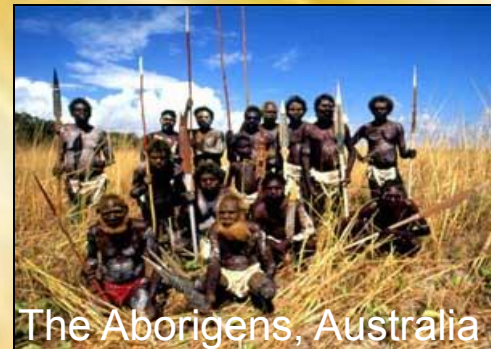
The Aborigines, Australia