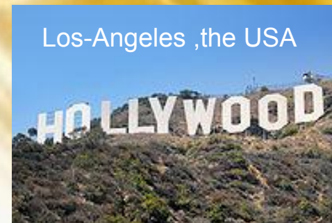
Los-Angeles ,the USA