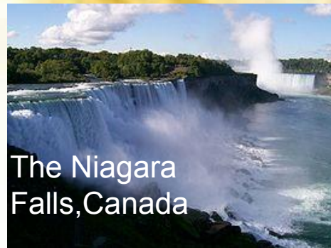
The Niagara Falls, Canada