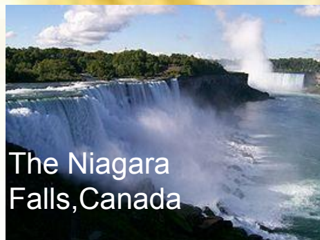
The Niagara Falls, Canada