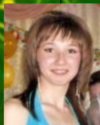
My elder sister