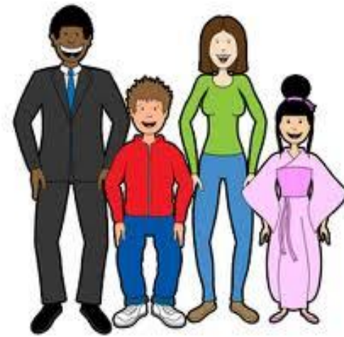
Ted David Gloria Lisa

4. Those are my friends Gloria and Lisa . ( plural + far )