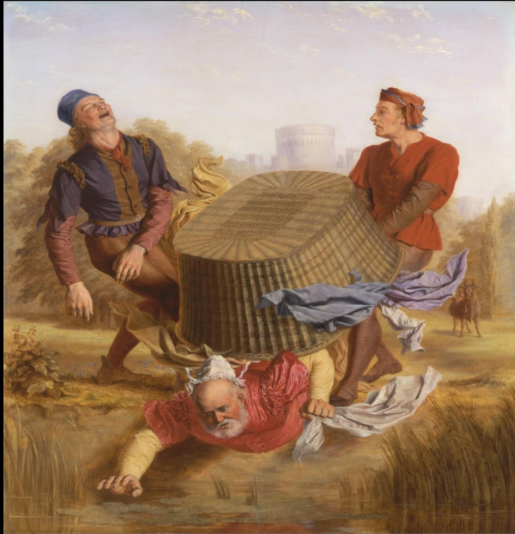
Dumping the contents (including Falstaff)