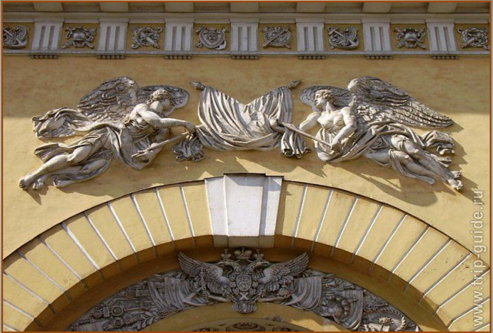
Two Geniuses of Glory are above the arch.