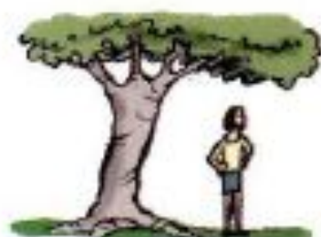
under a tree