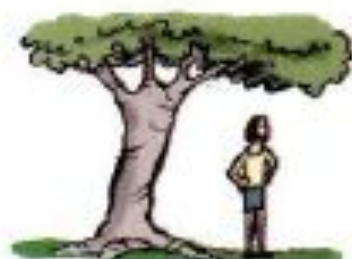
under a tree