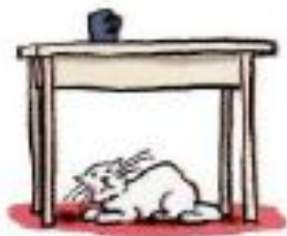
under the table