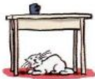
under the table