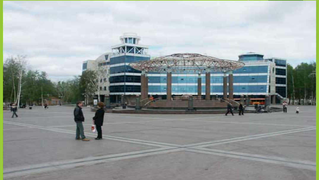
Fountain on the central square