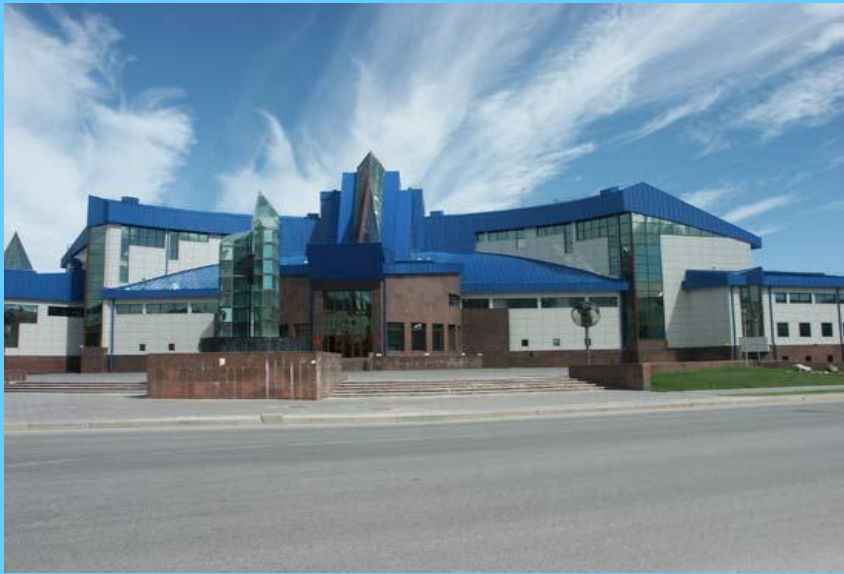
Museum of Geology , Oil and Gas.