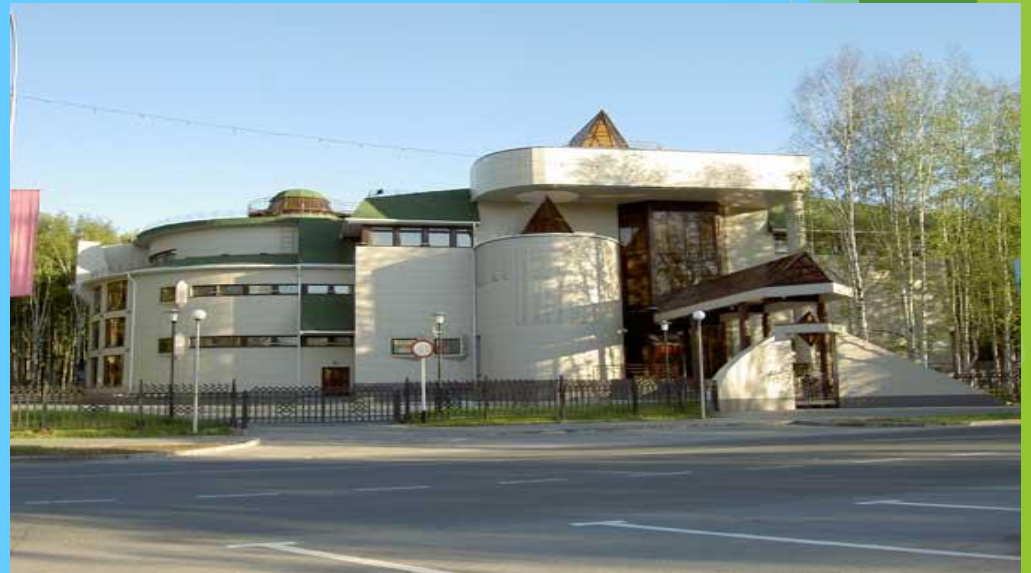
Museum of Nature and Man.