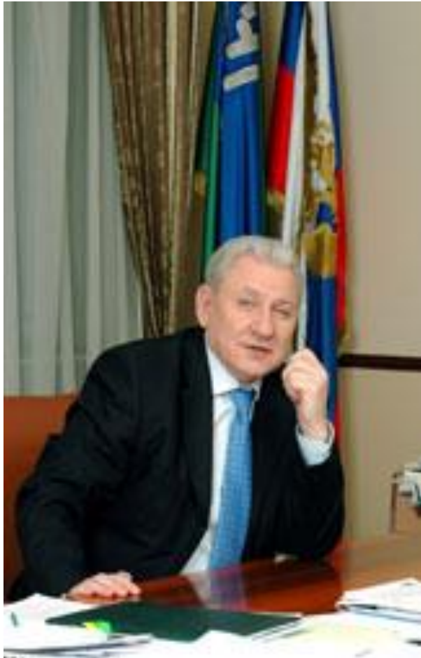
Alexander V. Filipenko.

The Governor of the Khanty-Mansiysk Autonomous district-Ugra