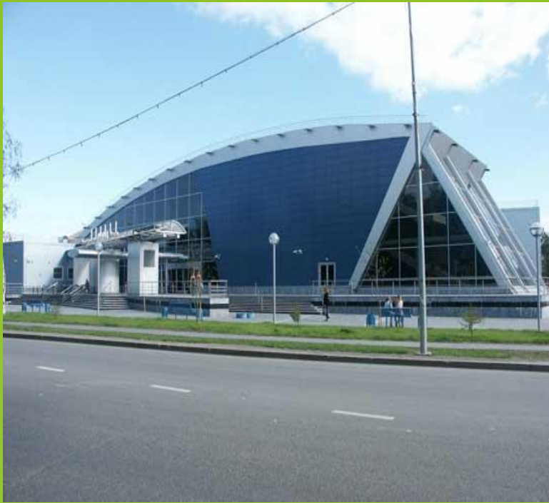
Entertainment complex "Langeland"