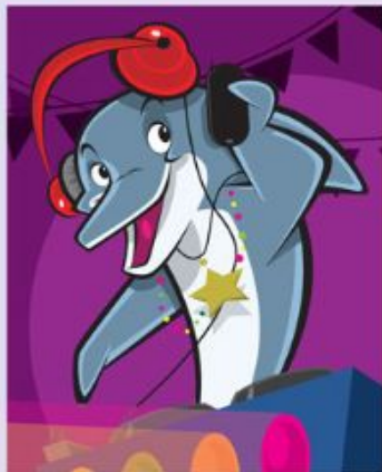
A dolphin on the phone.