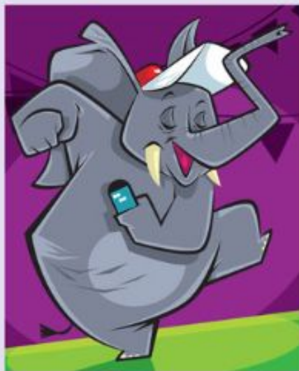
An elephant with his phone.