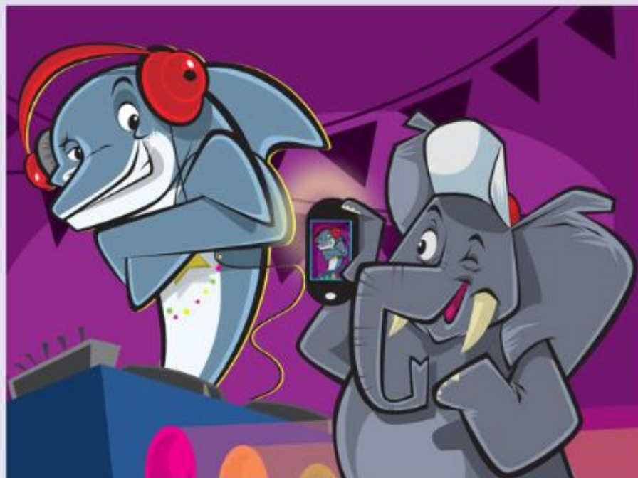
The elephant's taking a photo of the dolphin with his phone.