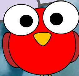
A RED BIRD