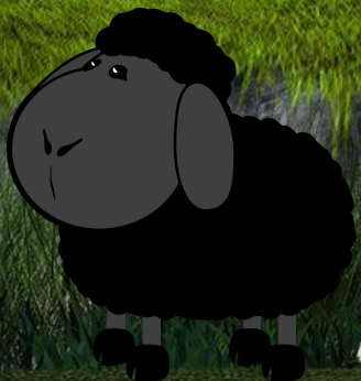
A BLACK SHEEP