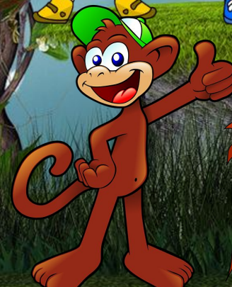
And a MONKEY