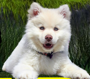
A WHITE DOG