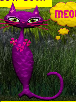
A PURPLE CAT