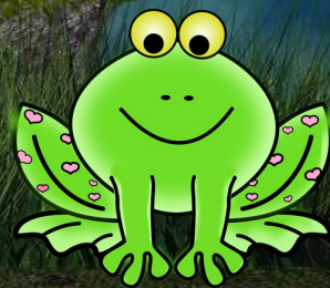
A GREEN FROG