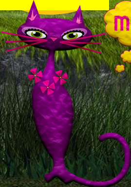
A PURPLE CAT