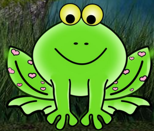
A GREEN FROG