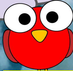
A RED BIRD