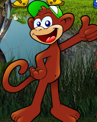
And a MONKEY