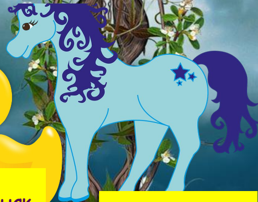
A BLUE HORSE