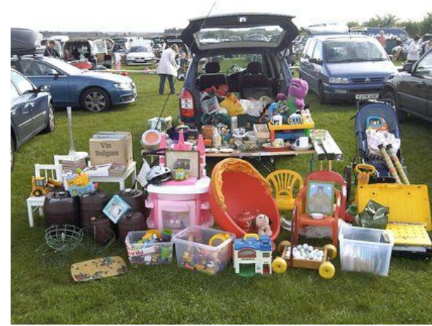
Car boot sale