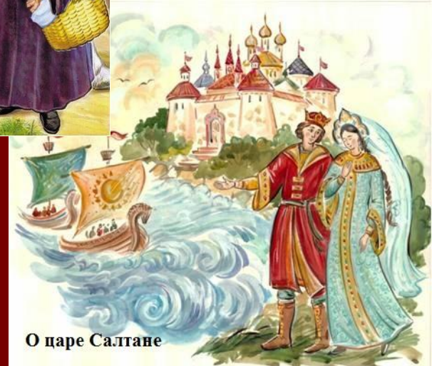
О царе Салтане