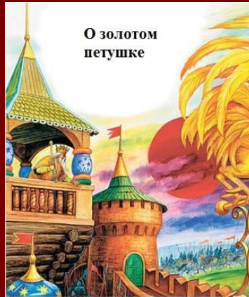
О золотом петушке