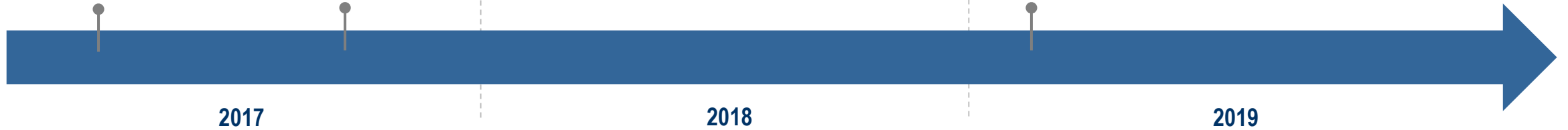
Paris & OCC Visit

In this slide we will show 8-9 pictures in a timeline mode. Plan is to present this slide while having a video imbed in the slide.