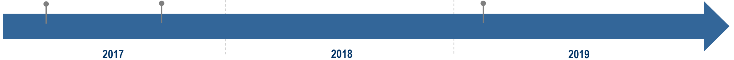
Paris & OCC Visit

In this slide we will show 8-9 pictures in a timeline mode. Plan is to present this slide while having a video imbed in the slide.