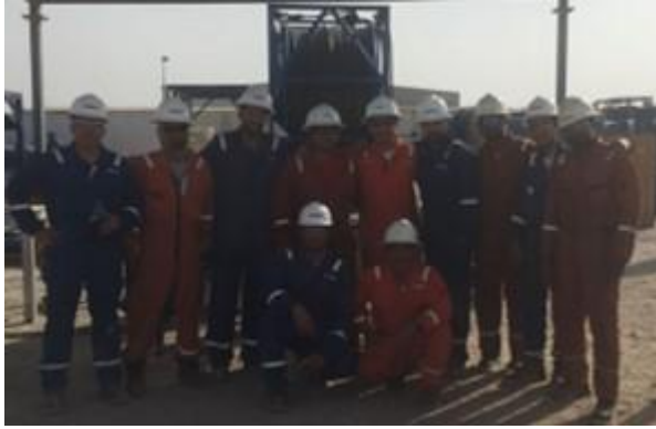
First ACTIVE Xtreme encroachment Job