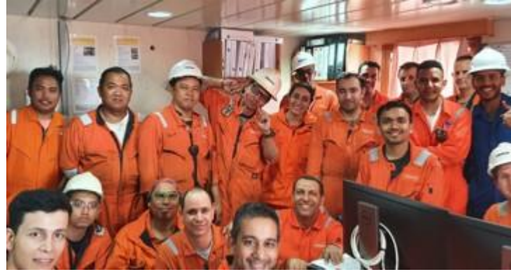
First Stim (MaxCO3) Job