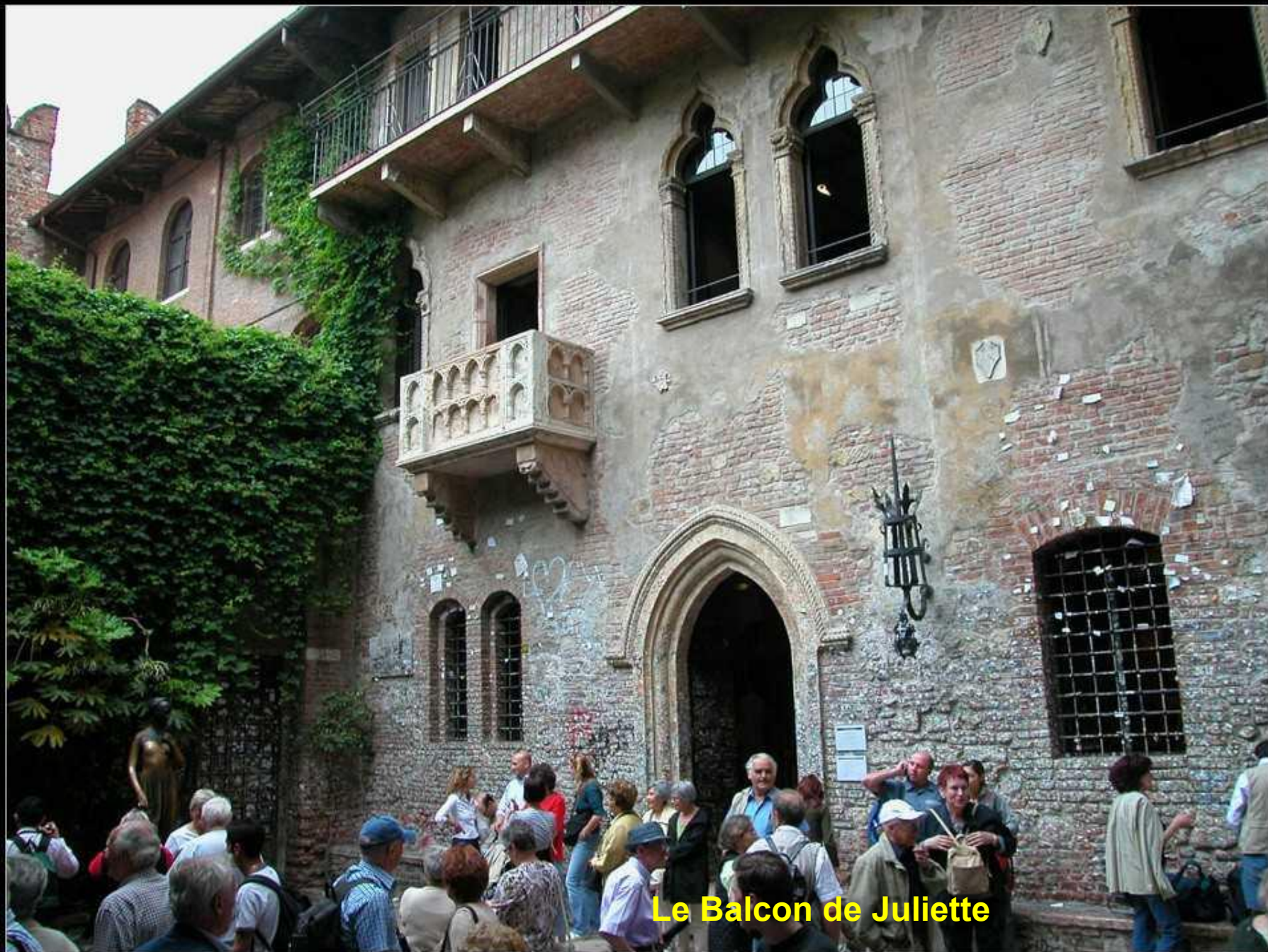
Le Balcon de Juliette