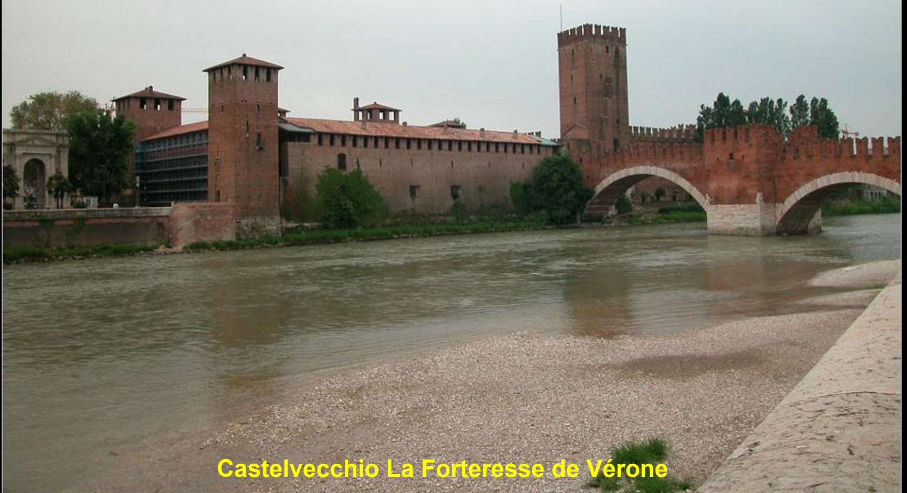
Castelvecchio La Forteresse de Vérone