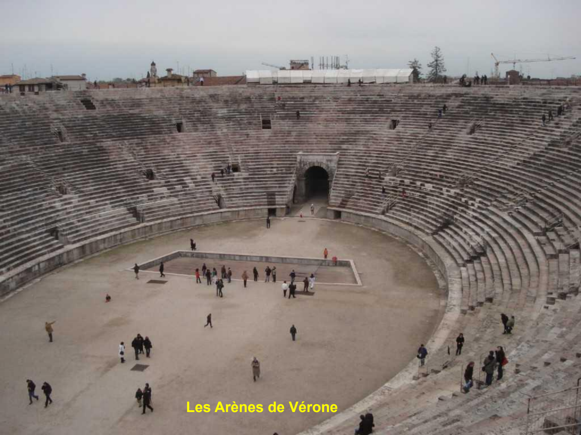
Les Arènes de Vérone