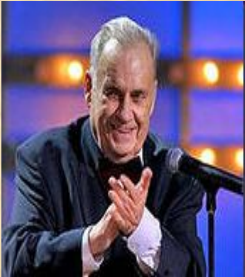
Eldar Ryazanov 1927 -