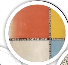
VAN DER LUBBE