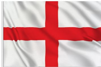
St George's Flag, the England Flag