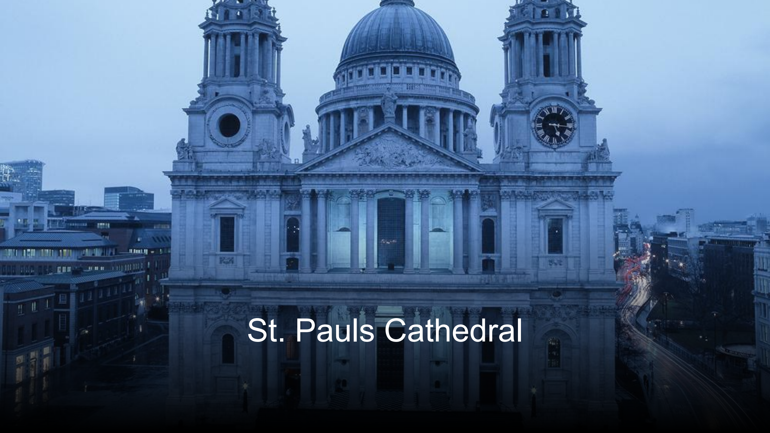
St. Pauls Cathedral