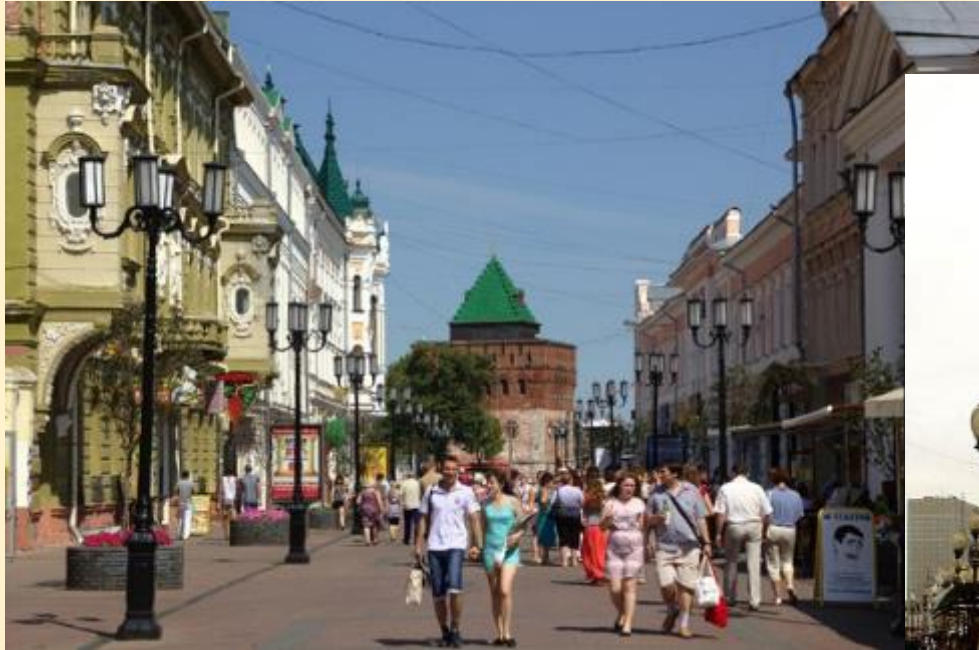
Bolshaya Pokrovka, Nizhniy Novgorod

They look modern with their tall buildings, interesting architecture and design.