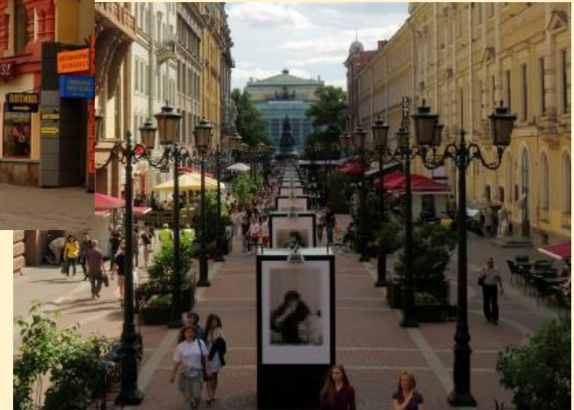
Malaya Sadovaya, Saint Petersburg